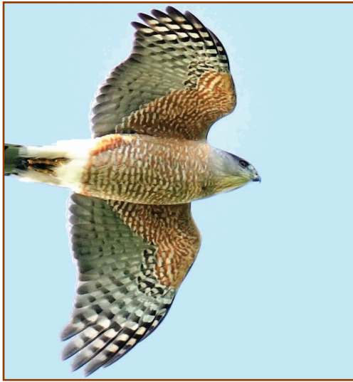
Cooper's hawk