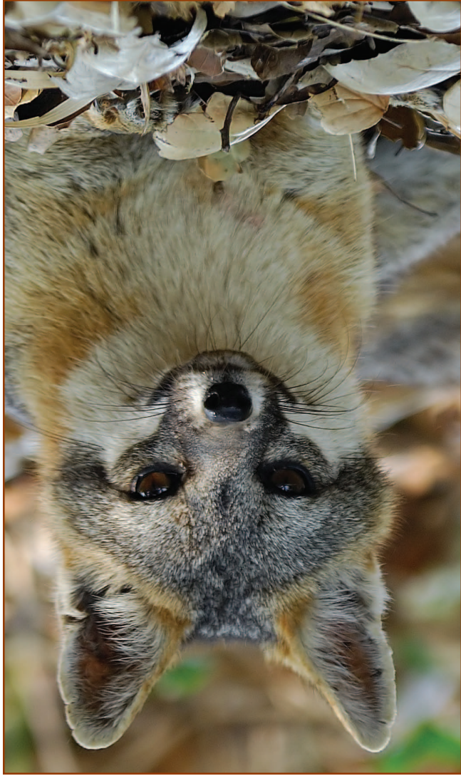
Gray fox by Jerry Ting

Second-generation anticoagulant products designed to kill rats and mice are also killing birds of prey, pets like dogs and cats, and many species of wildlife, including several endangered species. Recently, the mate of famous New York City red-tailed hawk Pale Male was confirmed to have died from ingesting a poisoned rat. These products are also poisoning children. According to the United States EPA, between 1999 and 2003, 25,549 children under the age of six had poisoning symptoms after exposure to rodenticides. In 2008, the U.S. EPA determined that various rodenticides posed an "unreasonable risk" to children, pets, and wildlife. The EPA gave the companies three years to switch to safer products, but three companies—Reckitt-Benckiser, Spectrum, and Liphatech—have refused to do so and have tied up the EPA's cancellation process in appeals. These products contain "second generation" anticoagulant compounds that can poison pets and children and cause hawks, owls, and other wildlife to bleed to death.