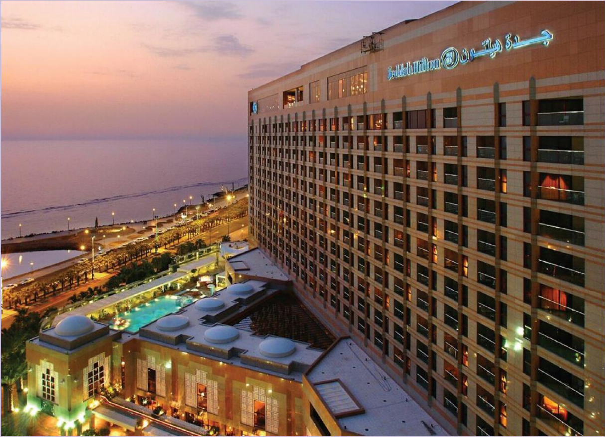
HILTON JEDDAH CITY, RED SEA COAST