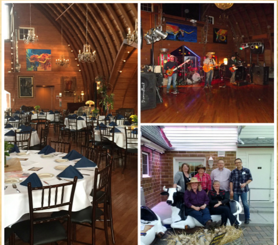
Photos from our 2014 Blue Jeans Ball