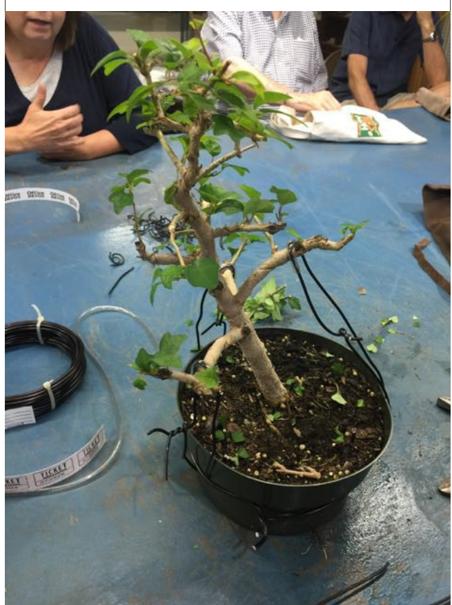
Post haircut and some wire, the journey has begun

Many thanks to everyone who brought trees to the workshop.