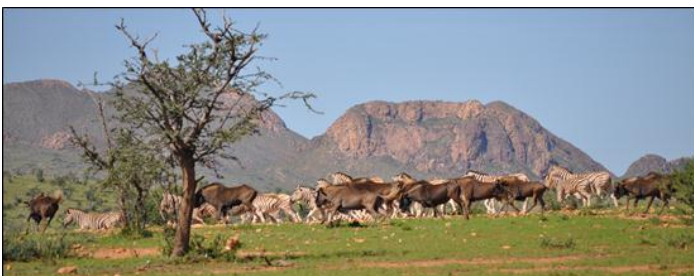
Zebras and Wildebeests on a River Crossing Lodge Game Drive

During our visit, we learned that we needed to change two of our optional conference tours. We traveled up to Okahandja to find that the Crafts Market experienced a devastating fire last winter. Although they plan to have the market rebuilt by July, we decided to drop that trip from Tour #2 on Sunday and instead spend more time at Okapuka Game Reserve returning to Windhoek to prepare for the Vice-Chancellor's reception.