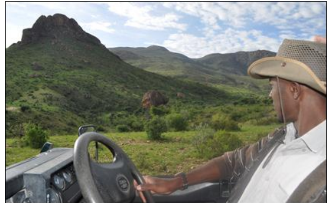
Game Drive Through the Auas Mountains at River Crossing Lodge

Second, we learned that Daan Viljoen Park was closed for redesign under new management. We were invited to a new game reserve at River Crossing Lodge just east of Windhoek in the Auas Mountains, less than a 10 minute drive from downtown. They offer a four hour game drive every morning and afternoon through the Auas mountains and you can see twenty animal species including wildebeest, zebra, giraffe, eland, steenbok, and numerous bird species.