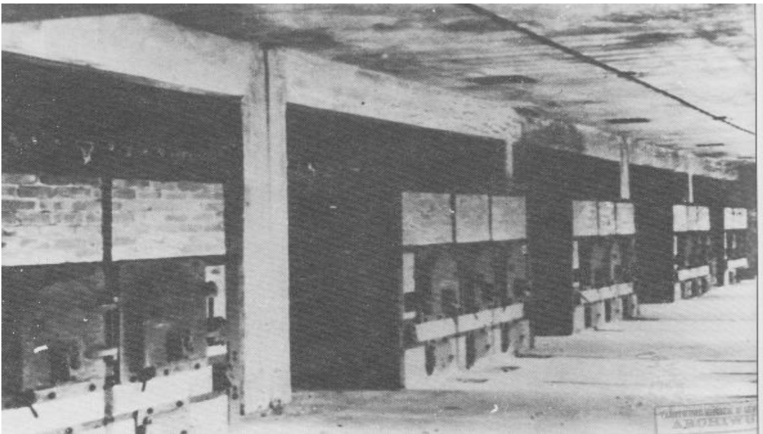
Gas chambers at Auschwitz.