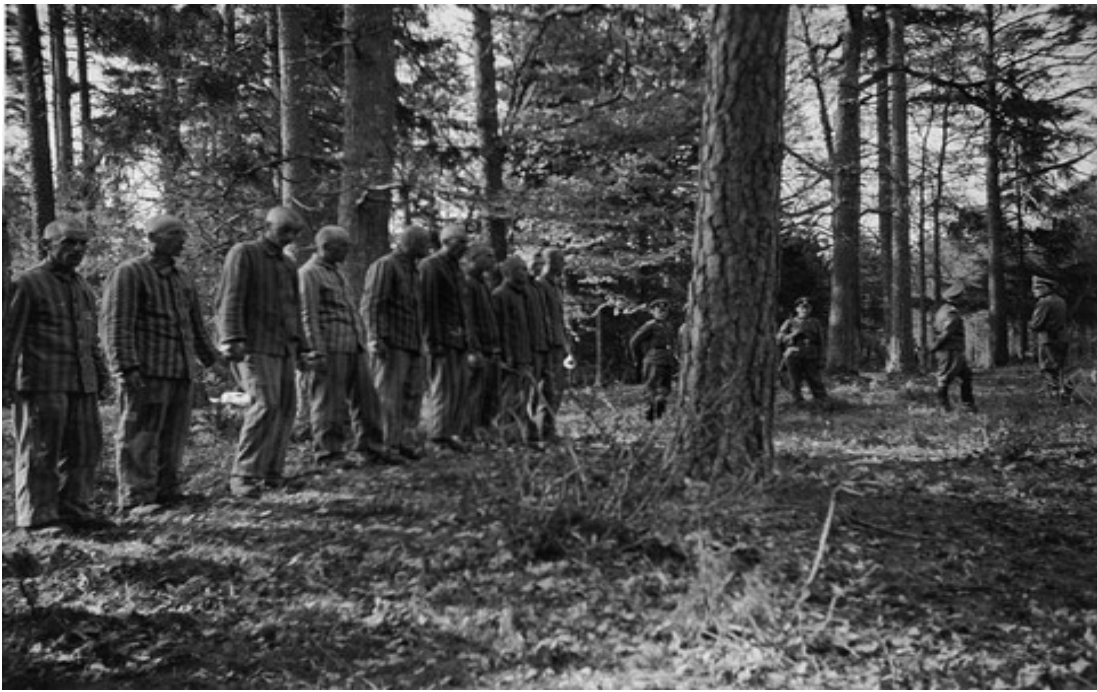
Jewish prisoners from Buchanwald awaiting execution in the bush 1938.