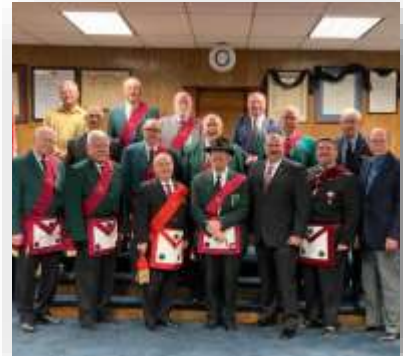
Knight Masons visiting together

The two Chapters regularly visit each other to assist and to observe the performance of the Green Degrees.