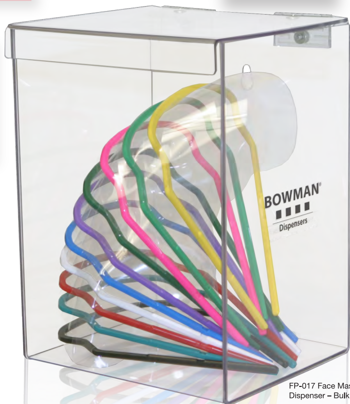
FP-017 Face Mask Dispenser - Bulk