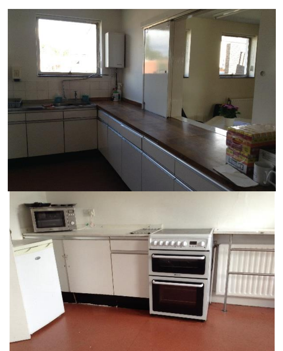
Kitchen with cooker, fridge and microwave – crockery and cutlery