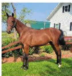
Al-Mar Wind Up #20