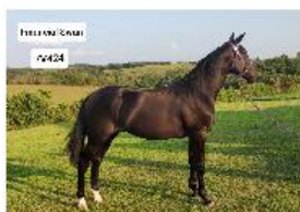
Financial Swan #17