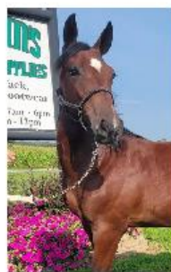
Flash Rose Photo #38