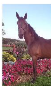
Al-Mar Kinky Jet #15