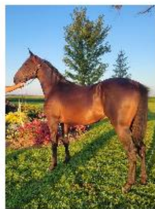
Blew Away Photo #10