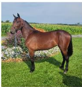
SV Queen of Hearts #11