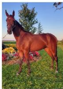
Al-Mar Miss Jetta #34