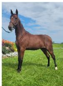
Flash of Glory #19