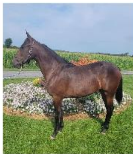
Fillister Photo #2