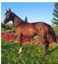
Al-Mar Golden Talk #25