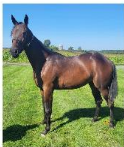
Club Flush #41