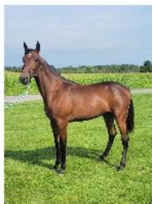
SV Blushing Moni #8