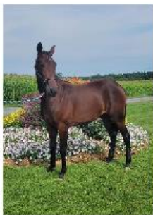
Easy Moon Photo #29