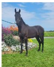
Easy Money Photo #29