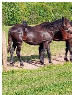
Wisco Tootsie #46