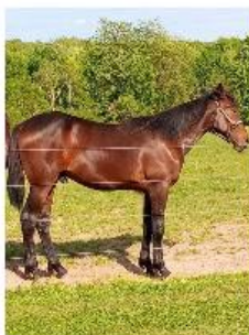
Wisco Ace #43