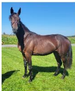
Al-Mar Vestal Wind #7