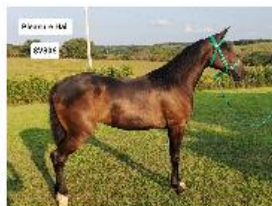
Pleasure Hall #64