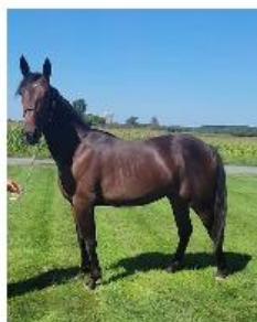
Al-Mar Attraction #28

EXIT 100 – 3 miles north of Cannon Falls on Highway 52 to County Road 86, then take frontage road on west side of HWY 52, 1 mile south.