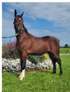
Southern Pixie Photo #5