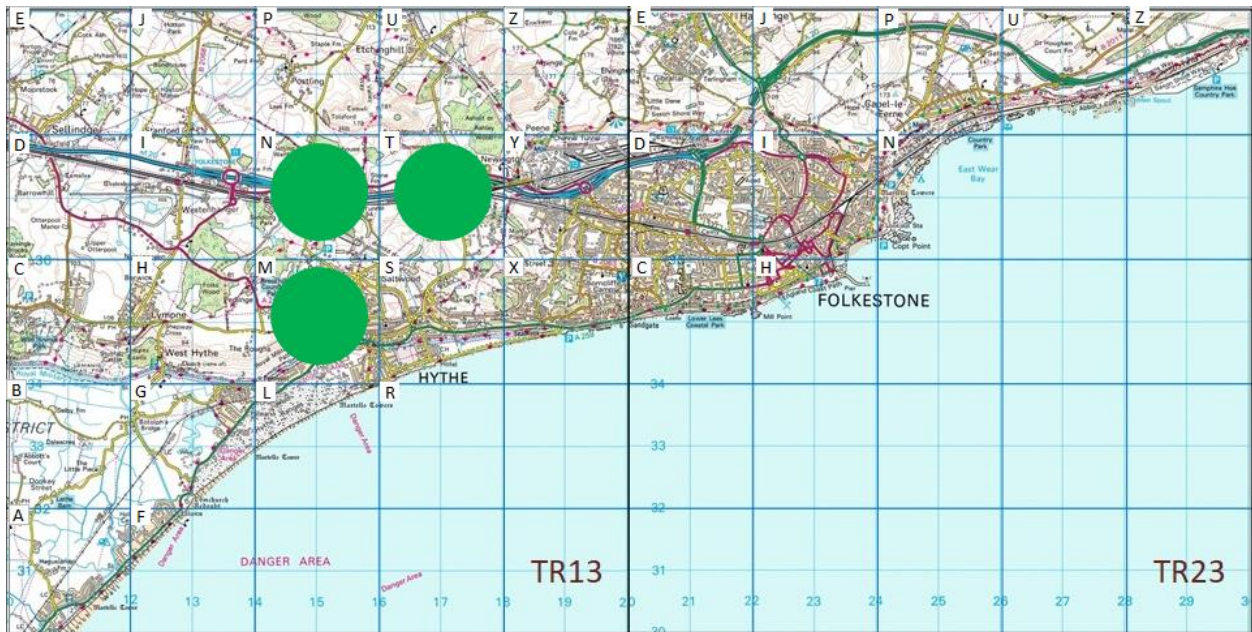
Figure 3: Distribution of all Dipper records at Folkestone and Hythe by tetrad

Figure 3 shows the distribution of records by tetrad.