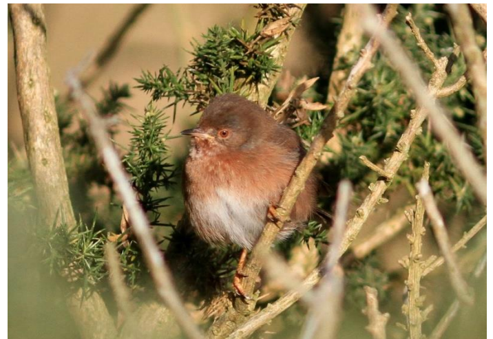
Dartford Warbler at Abbotscliffe (Phil Smith)