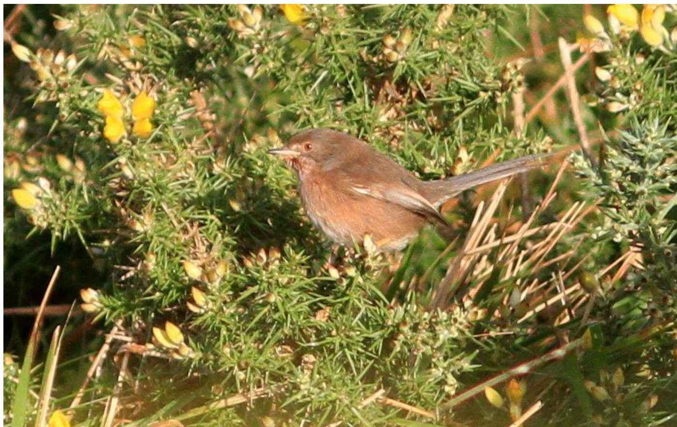
Dartford Warbler at Abbotscliffe (Phil Smith)