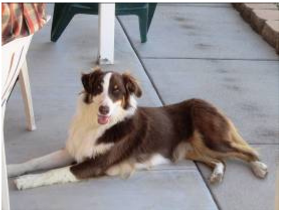
Local dog that joined the fun