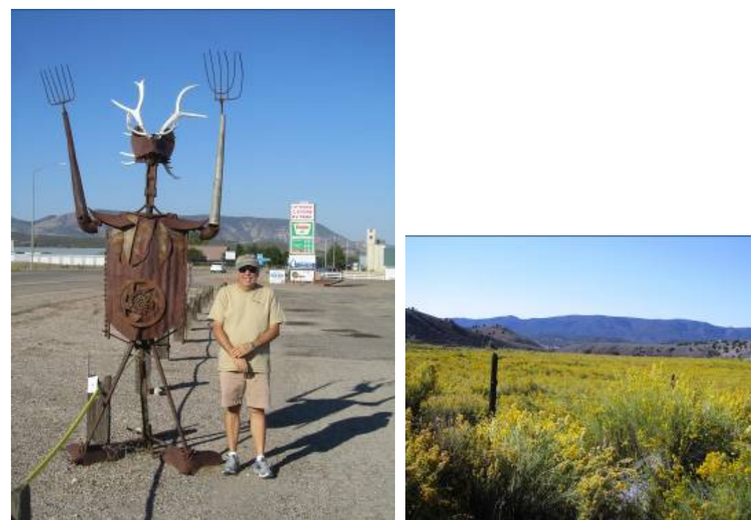
Who is this guy?

The September field trip was to Barclay NV by way of Enterprise, where we stopped to view a rather strange sculpture. The road west from Enterprise was delightful, with the desert in bloom with fall colors of yellows and gold of the rabbit brush and winter fat.