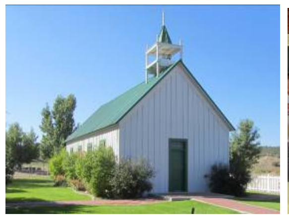
Barclay school house