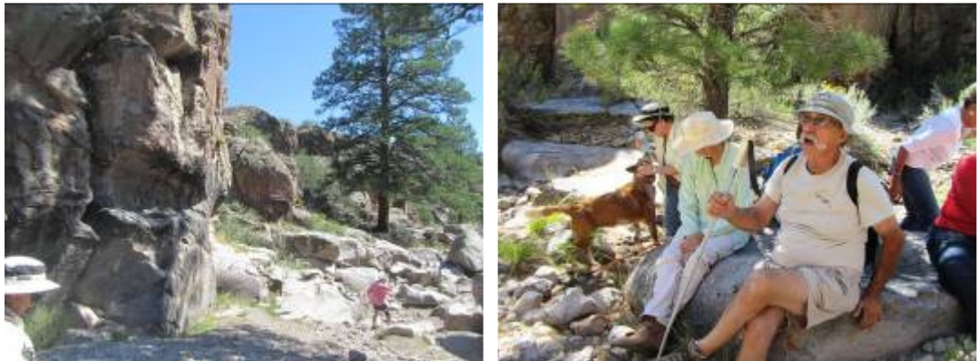
The canyon entrance

The petroglyphs were located in a canyon a few miles from Barclay.