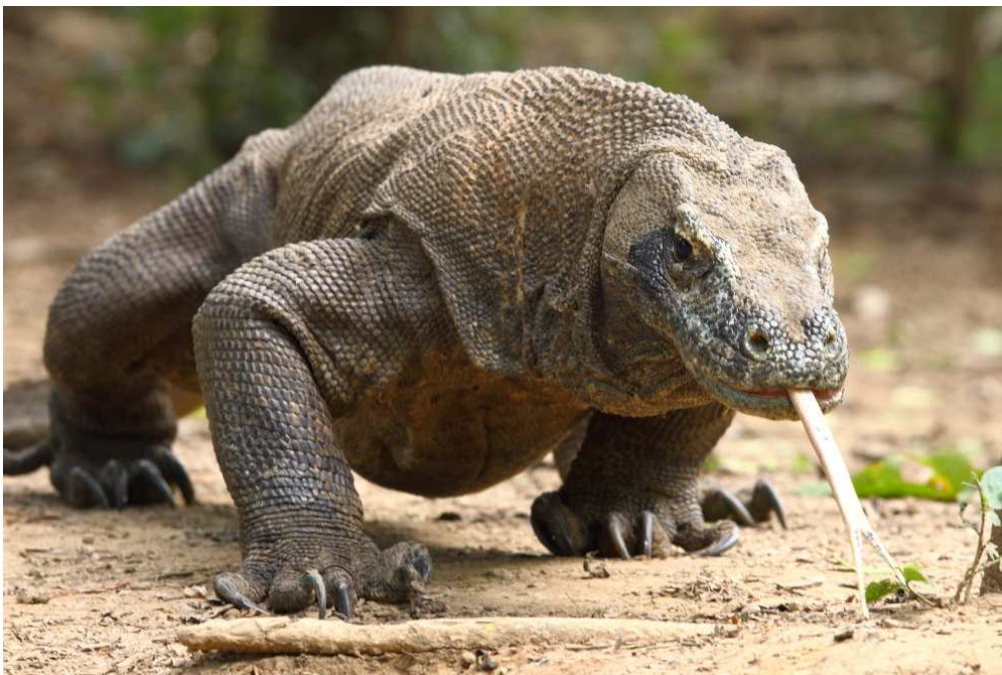
Quite a Dragon! The Komodo can reach 3 meters long and weigh 136 Kilograms.

Animals that escape the jaws of a Komodo will only feel lucky briefly. Dragon saliva teems with over 50 strains of bacteria, and within 24 hours, the stricken creature usually dies of blood poisoning. Dragons calmly follow an escapee for miles as the bacteria takes effect, using their keen sense of smell to home in on the corpse. A dragon can eat a whopping 80% of its body weight in a single feeding.