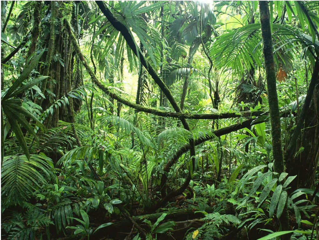
The dense interior of the island