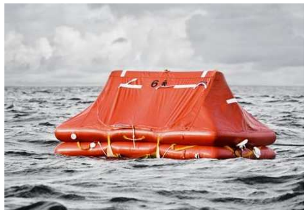
The floating survival tent!

Unfortunately a huge storm blew up over night. You were buffeted about in the raft, but it didn't leak and you stayed safe. In the morning the storm had gone and you looked out of the sort of floating tent. You could see none of the other rafts! They must all have been blown in other directions.