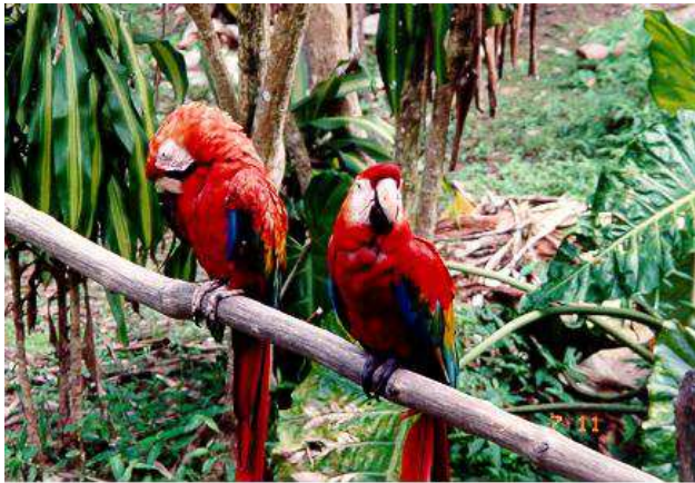
Red & Blue Macaw

There is evidence that humans have lived here in the past- only a matter of a few years ago. There are deserted huts, there are some old leaky boats, there are some fishing nets hanging up – it seems that the people who lived here left in a hurry.