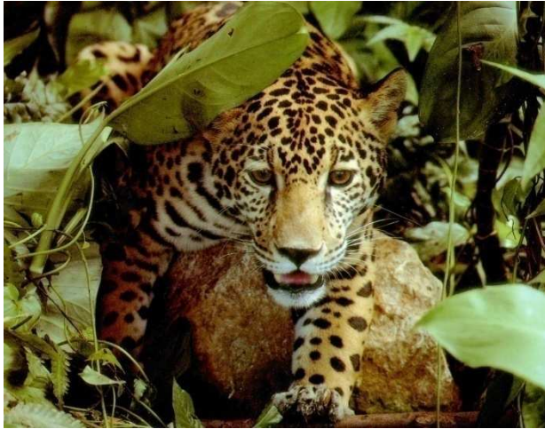
The jaguar - top predator

See the contents of the extra pack for more of the animals that you are likely to encounter on your tropical island.