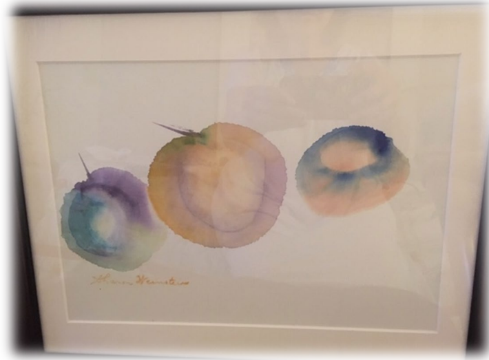
Whimsical Bowl with Fruit

She is "fascinated by the close forms that are created in the emptiness of space, conveying the presence of the eternal quiet."