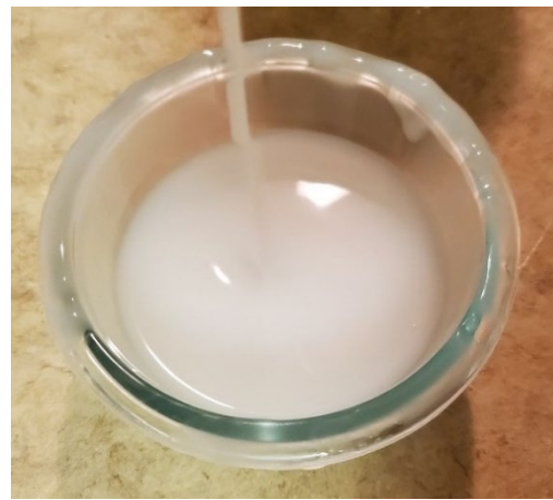
Fig. B: Dense wheat paste in the beginning of Step 4 (left); semi-transparent paste in the end of step 4 (right)