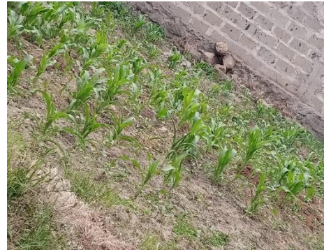
Image of the family's garden

you give, it will be given to you good measure, pressed down, shaken together, and running over (Luke 6:38). A family has since sown into them, giving them maize and vegetable seeds to plant. God has blessed them with a garden through this supernatural provision and is promoting them to become a food supplier for their community. To God be the glory!