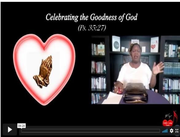
Celebrating the Goodness of God (Ps. 35:27) Praise, Prayer, & Confession