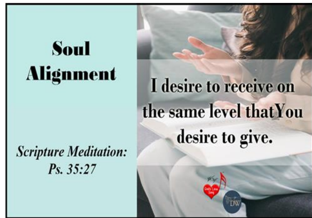
Soul Alignment: I Desire to Receive on the Same Level You Desire to Give (Confession)