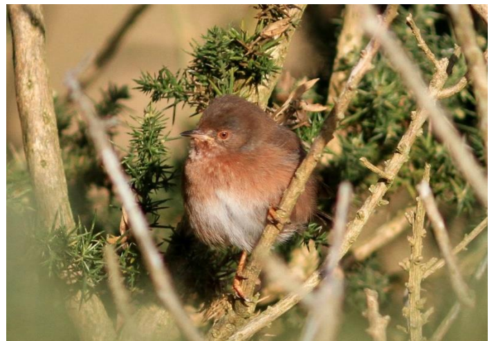
Dartford Warbler at Abbotscliffe (Phil Smith)