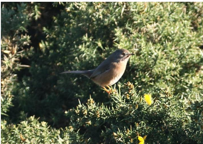
Dartford Warbler at Abbotscliffe (Paul Edmondson)