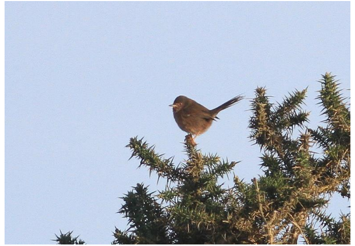
Dartford Warbler at Abbotscliffe

The range and population fluctuate due to vulnerability to severe weather. It is partially migratory and dispersive: many birds remain all year on the breeding grounds, but autumn and winter records are frequent in non-breeding areas, probably mainly involving juveniles (Snow & Perrins 1998).