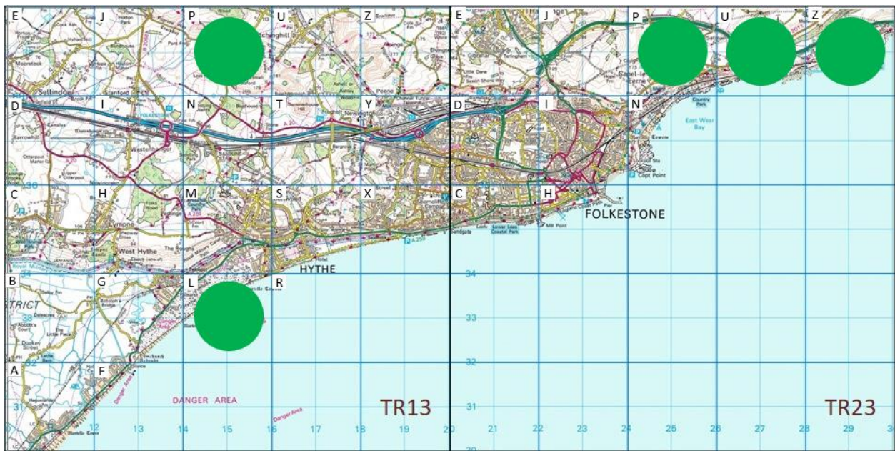
Figure 3: Distribution of all Dartford Warbler records at Folkestone and Hythe by tetrad

Figure 3 shows the distribution of records by tetrad. Apart from the first at Tolsford Hill and one at Capel-le-Ferne Orchid Field in 1992 all of the other 24 records up to the end of 2004 were at Abbotscliffe, but seven of the 15 since were at Samphire Hoe, with the first for Hythe Ranges noted in 2017.