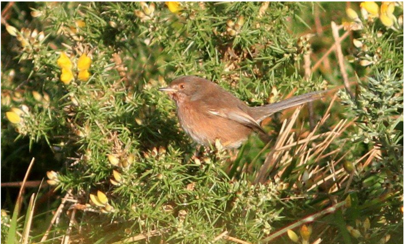
Dartford Warbler at Abbotscliffe