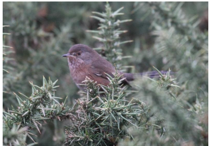
Dartford Warbler at Abbotscliffe (Ian Roberts)