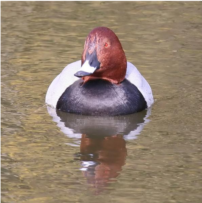
Pochard on the Royal Military Canal at Seabrook