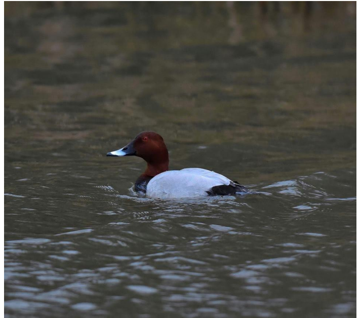
Pochard on the canal at Seabrook (Nigel Webster)