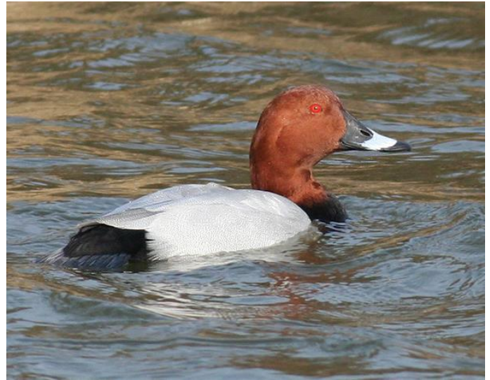
Pochard at Seabrook (Brian Harper)

It is a regular but uncommon breeding species in Kent, also a passage migrant and winter visitor in large numbers.