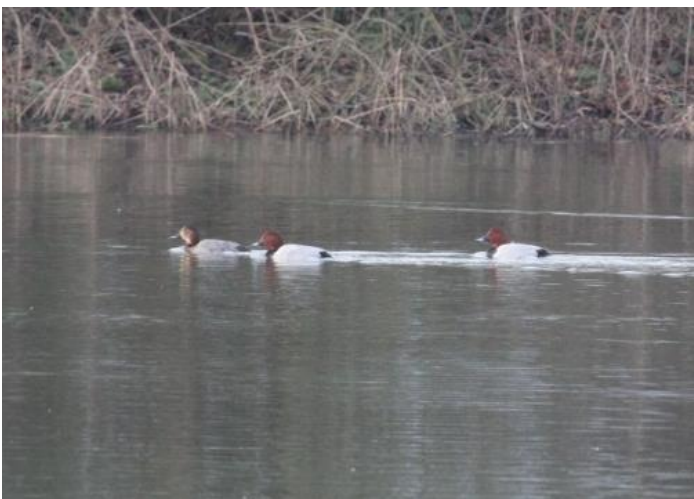
Pochard at Folkestone Racecourse