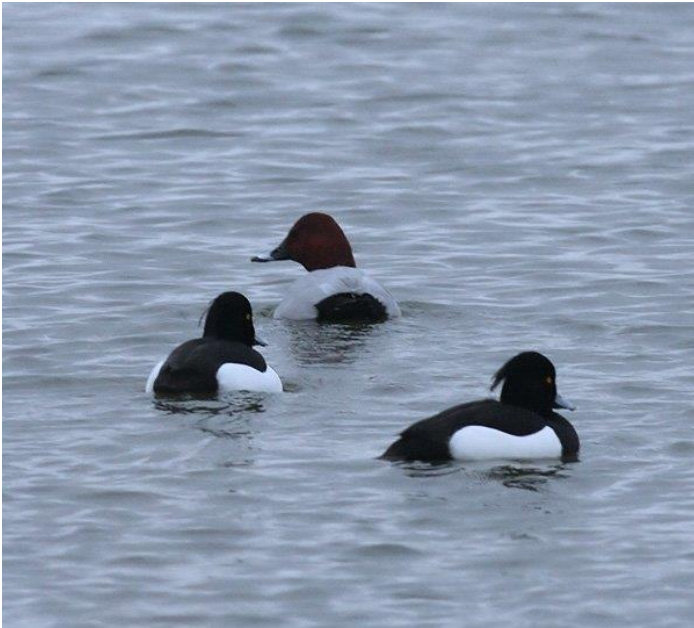
Pochard & Tufted Ducks at Nickolls Quarry (Brian Harper)

It is genuinely rare elsewhere, with just 43 records over the 31 years since 1990. Coastal records have usually been associated with cold weather and have included counts of 20 flying west past Copt Point on the 3 rd January 1997, 30 flying west past Hythe on the 2 nd December 2010 and 12 flying east there the next day.