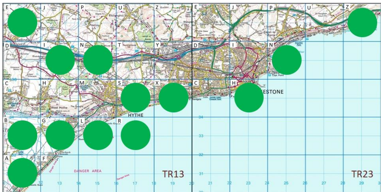
Figure 1: Distribution of all Pochard records at Folkestone and Hythe by tetrad

Figure 1 shows the distribution of all records of Pochard by tetrad, with records in 13 tetrads (42%).