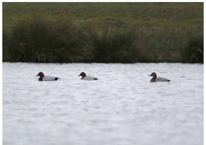
Pochard at Cock Ash Lake