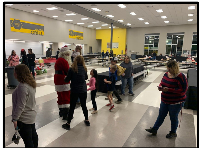
Families enjoy quality time together and meet with our special holiday guest.