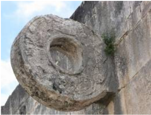
“Goal” for a ball court