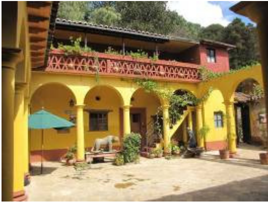
Courtyard of a villa