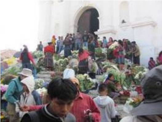
Flowers in front of a church