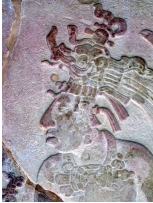
Carving in colored stone