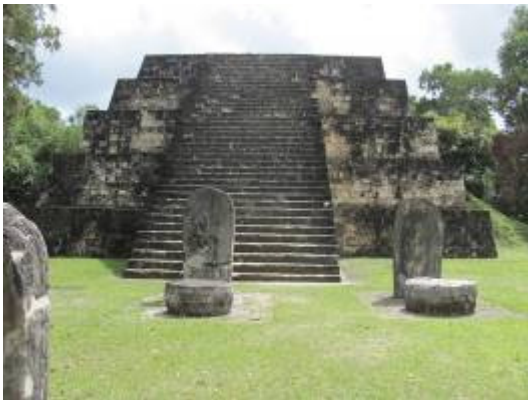
Pyramid with “Stola” in front