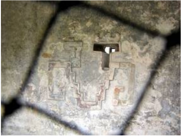
“T” Symbol shape