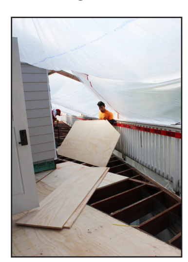
Construction worker laying the plywood for the new deck on Building C

second floor residents were temporarily displaced. The cooperation was outstanding.