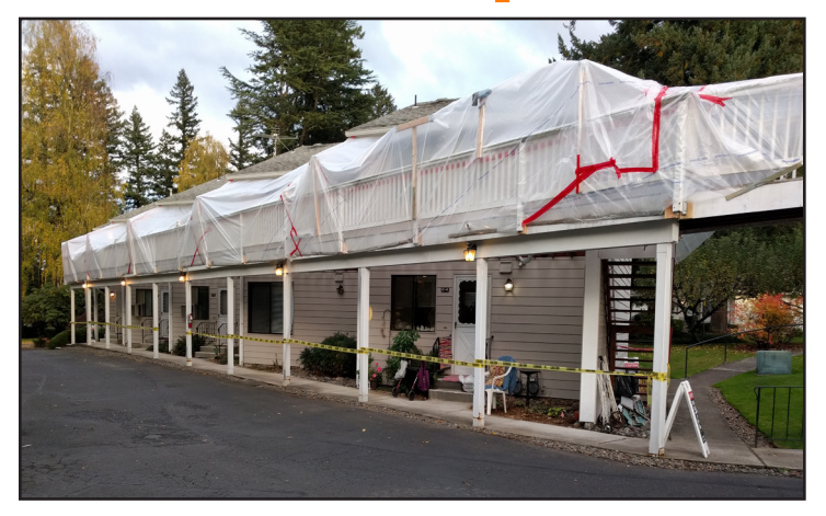
Building C with tarps and caution tape for everyone's safety, October 2018

uildings always require maintenance so last year the Board contracted a construction consulting firm to review all structures on the BSRC property and to present to the Board a comprehensive list of required maintenance.