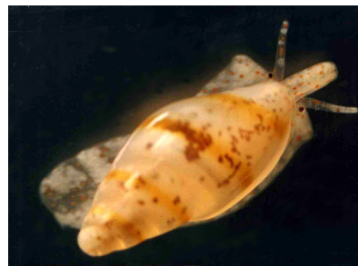
Dentimargo aureocincta 4 mm

If you are interested in participating, please contact Lynn Gaulin at shellhunter@gmail.com or (585) 671-2103 (cell) or (941) 755-1270 or me at peggy@shelltrips.com or (941) 355-2291. We need to have an idea of how many will be coming.