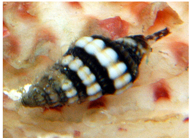
Vexillum hanleyi 3mm