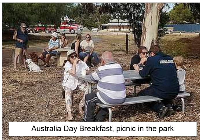
Australia Day Breakfast, picnic in the park