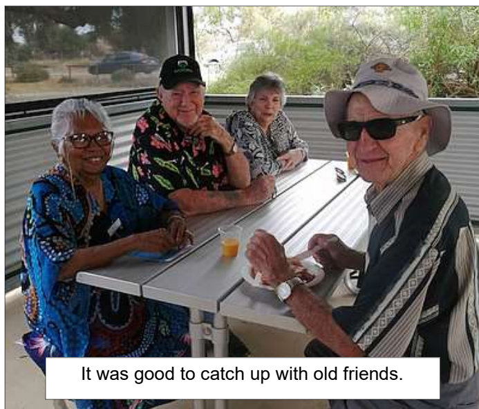
It was good to catch up with old friends.