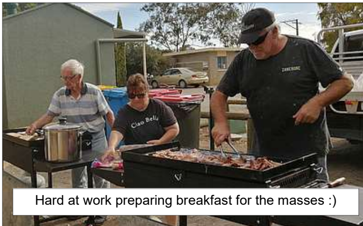
Hard at work preparing breakfast for the masses :)