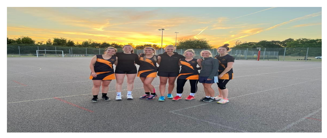
BRIDGE McFARLAND JETS - SUMMER SEASON DIVISION 1 WINNERS