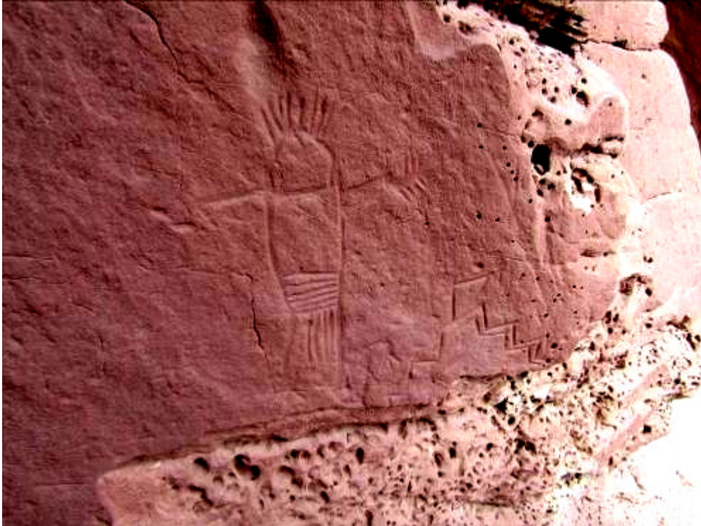
Figure 15 – a stylized anthro with a feathered head dress, out stretched arm with perhaps something in each hand, something around his waist. At the right is a double angled line and perhaps an arrow acting as a pointer. This glyph is differ than the others, and is perhaps much newer.