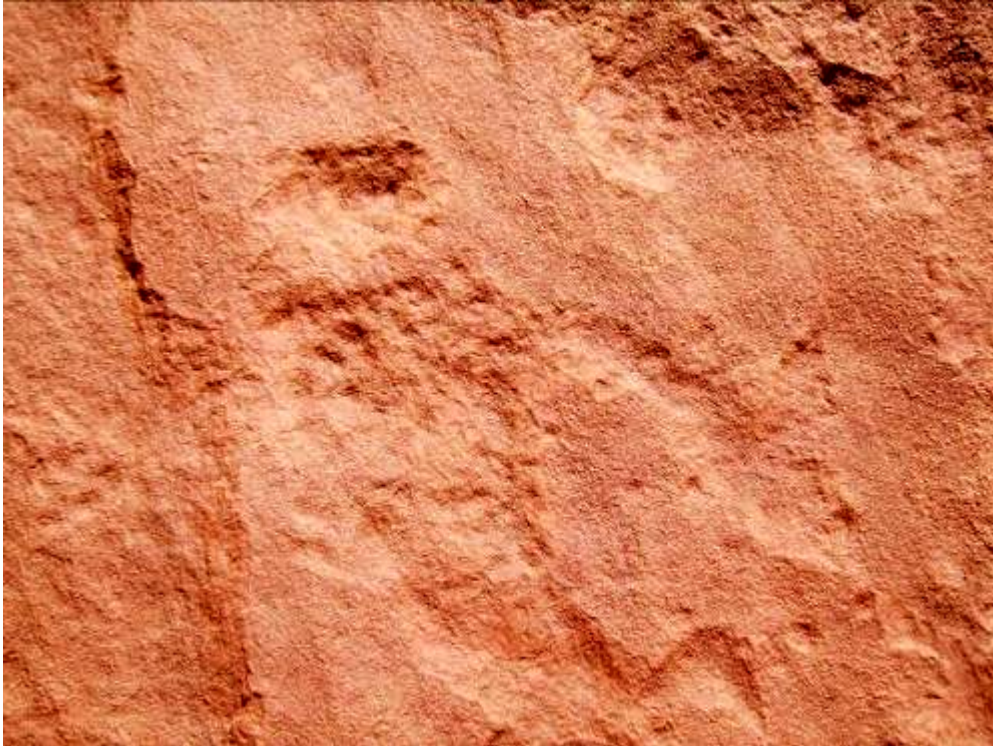
Figure 13 – a badly eroded glyph