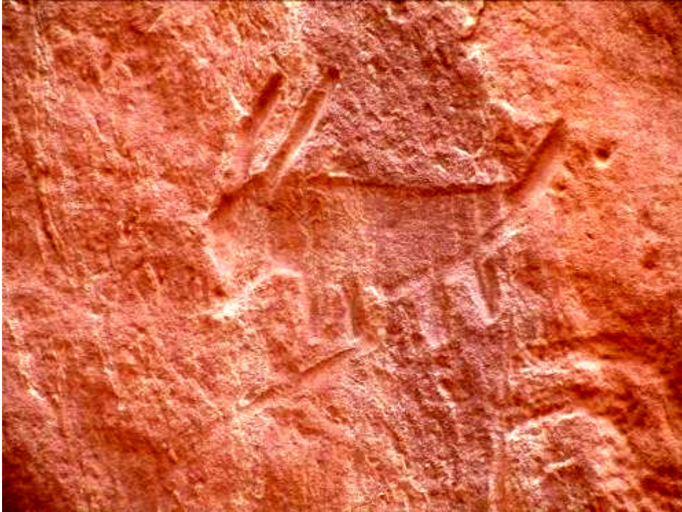
Figure 11 – what looks like a 4 legged animal – perhaps a sheep