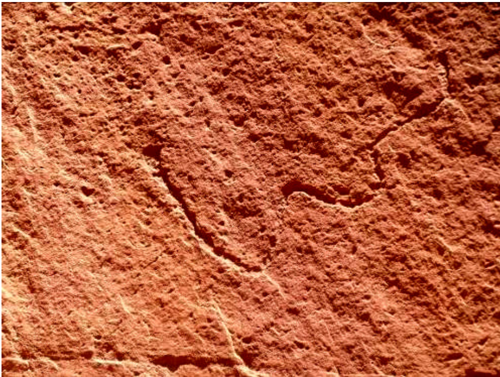
Figure 14 – a deeply pecked wavy line – perhaps a serpent