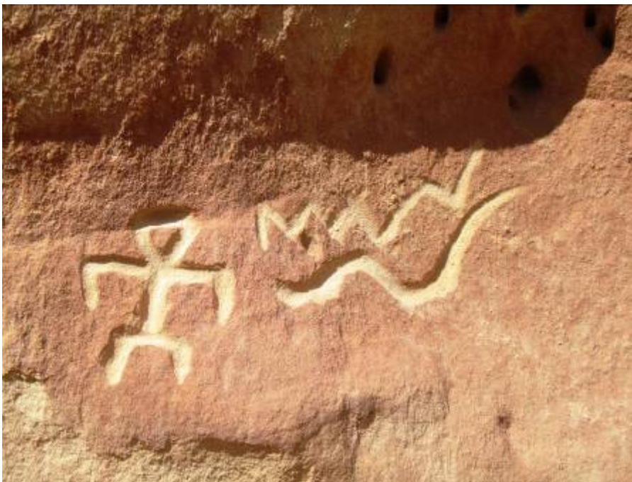
Figure 16 – a very recent glyph