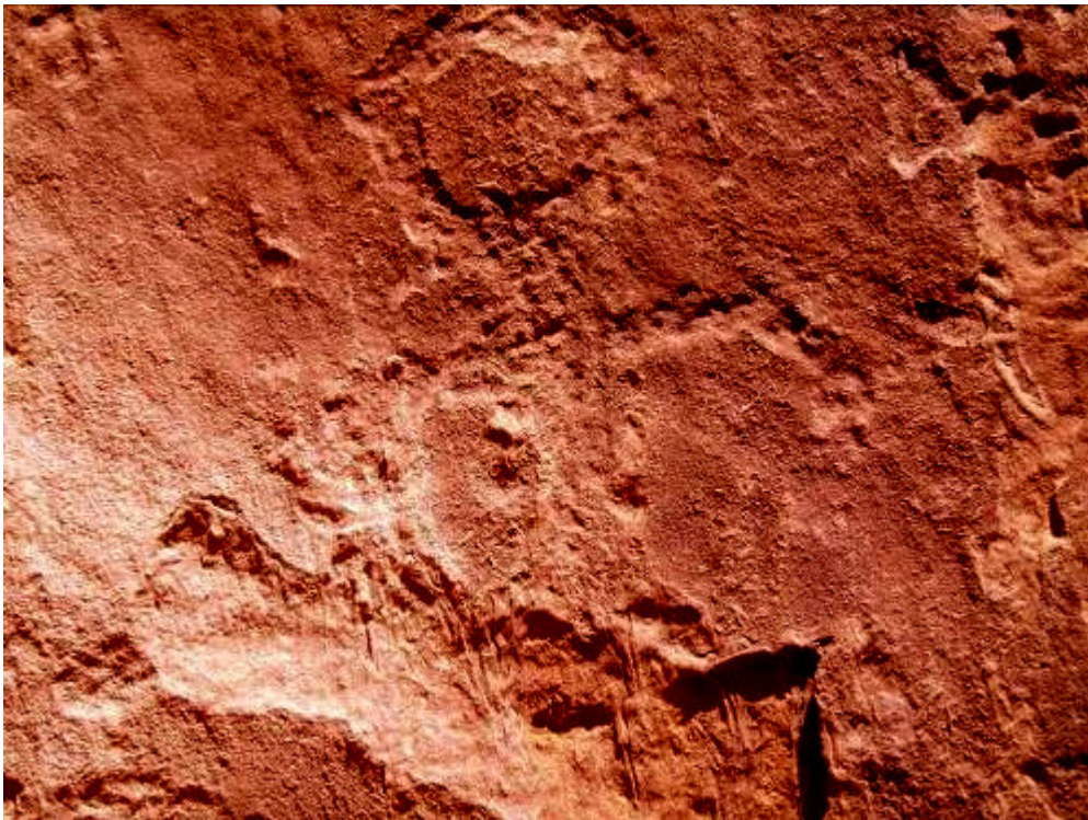
Figure 12 – what appears to be a stick figure anthro with a very prominent head. The pecking marks are very visible, however the glyph is badly eroded.