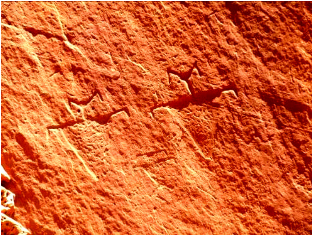
Figure 10 – Two images that look like owls

Also in the canyon is a prominent rock out cropping that has a set of petroglyphs (Figures 10 through 16). The majority of the glyphs are pecked onto a rock whose surface is poor in quality, resulting in glyphs that are badly eroded. The glyphs are still visible because they were pecked very deep into the rock surface.