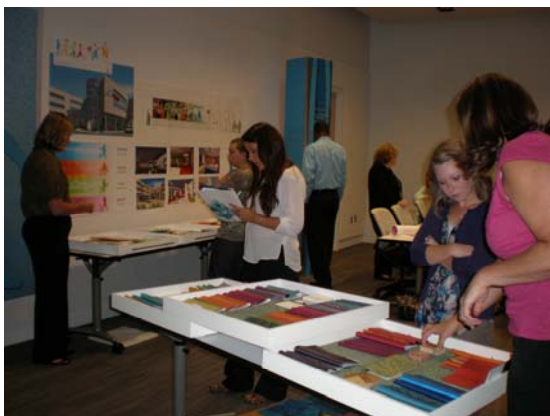
Mentoring Luncheon at Stanley Beaman & Sears

After the site visit, the group traveled a short distance to the office of Stanley Beaman & Sears, also located in downtown Atlanta. There, Stanley Beaman & Sears hosted lunch for the group, allowing the students to interact with architects and interior design leaders from the firm. The group enjoyed a wonderful lunch, while learning about the interiors process on a healthcare project. Students asked questions and viewed interior design work from some of the firm's completed projects.