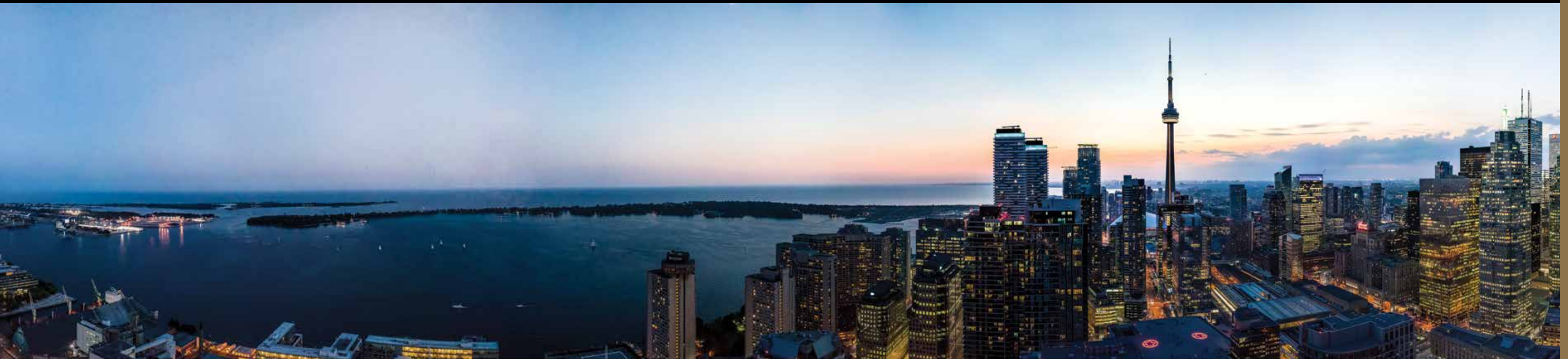
PRESENT VIEW FROM THE 55TH FLOOR