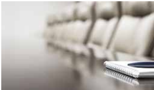
ALL RENDERINGS ARE ARTIST'S CONCEPT ONLY. E.&O.E.

Early morning laps? BBQ with friends? A play date for the kids? With a 50,000 square-foot state-of-the-art community centre complete with a 6-lane, 25-metre swimming pool and double gymnasium complementing The Prestige’s own array of recreational spaces, you’ll never run out of exciting things to do. Pinnacle One Yonge is all about fun and fitness. Designed to appeal to all ages, residents can enjoy everything from an outdoor walking track with fitness circuit to spin studio and gyms. And since Pinnacle One Yonge is family-friendly, there are two children’s play areas planned: one indoor, the other outdoor. There’s even a 10,000 square-foot dog run complete with washing stations for your pet pooch. When it comes to entertaining, the outdoor lounge offers BBQs and dining areas, while the indoor party room with a caterer’s kitchen, and private dining room provides plenty of space to indulge your inner host.