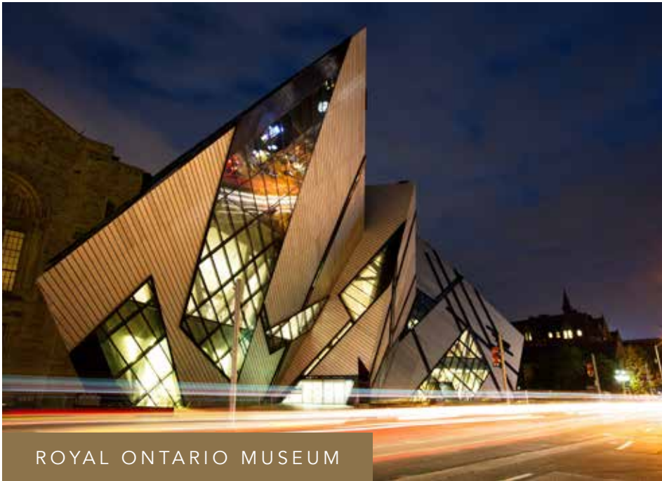
ROYAL ONTARIO MUSEUM