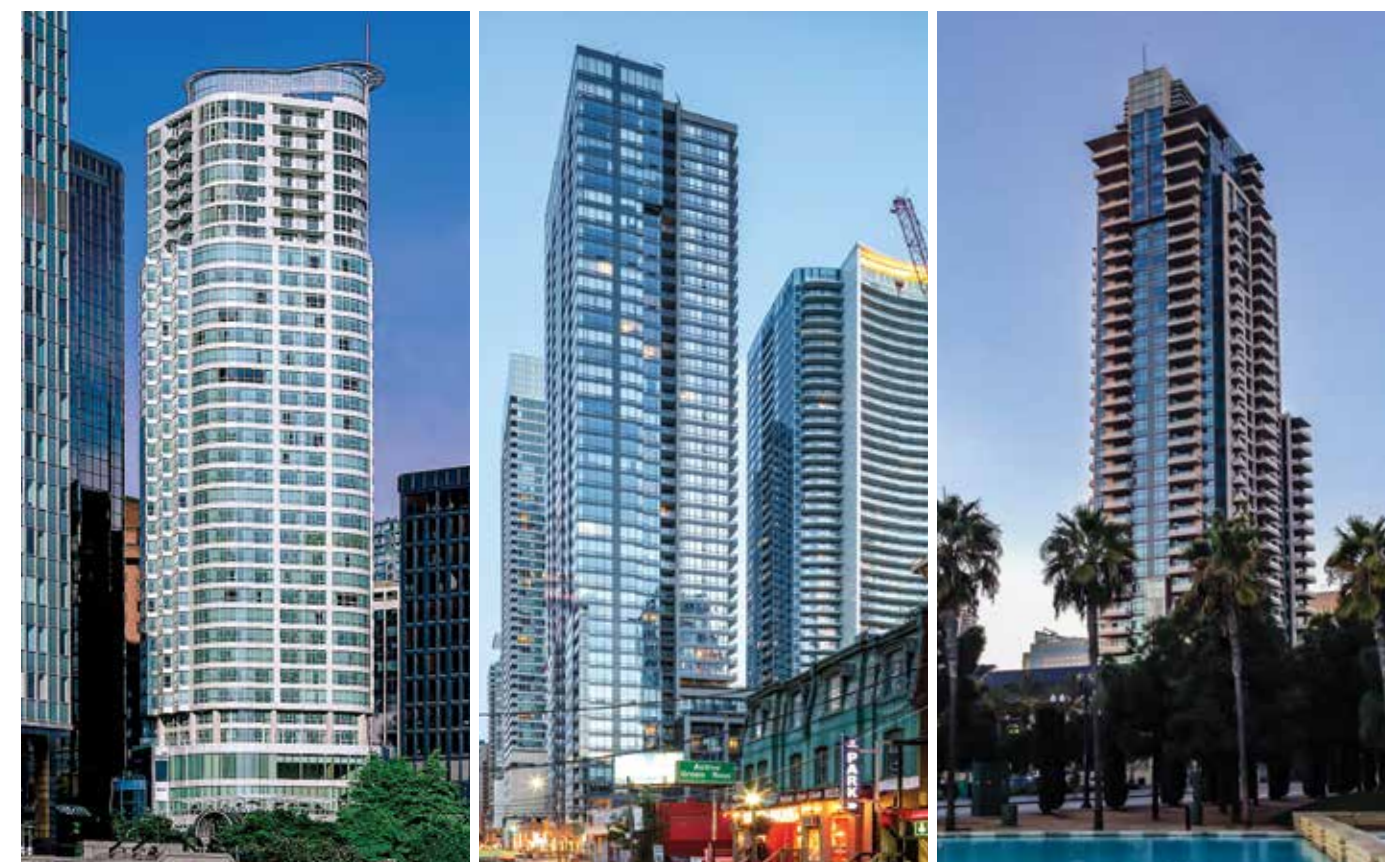
MARRIOTT PINNACLE HOTEL VANCOUVER