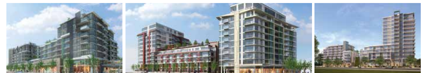
PINNACLE LIVING ON BROADWAY VANCOUVER