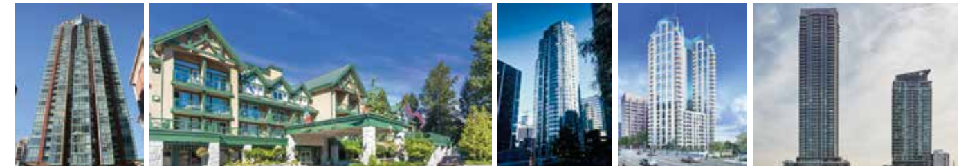
THE PINNACLE VANCOUVER

Discover the visionary lifestyle at Pinnacle Uptown, a Mississauga community where everyday comfort and convenience exists side-by-side with splendour and opulence. Set amidst lush surroundings, Pinnacle Uptown is an urban-suburban enclave where residents can get the best of both worlds.