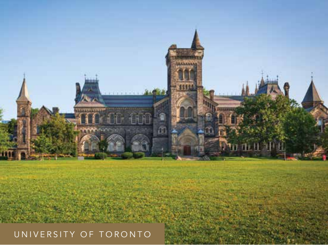
UNIVERSITY OF TORONTO