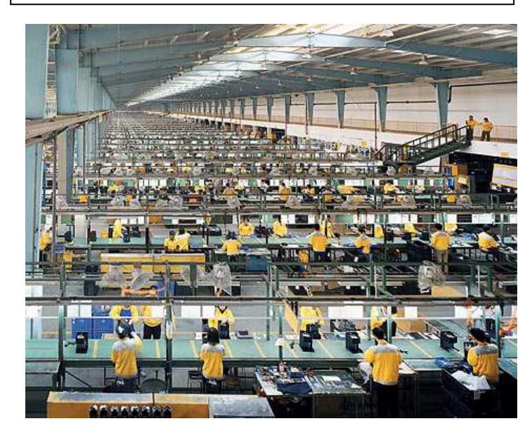
The factory was mind-bogglingly big

It seems that someone (or something) is trying to help, but what does the note actually mean?