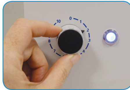
Variable speed control knob