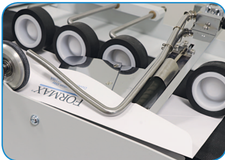
Precision moistening roller and flap closing bar accurately seal stacked or nested envelopes in a single pass