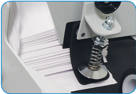
Envelope separator ensures single feeding

Optional: FD 430-10 Extended Sealing Kit for flaps up to 4" long