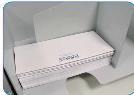
Adjustable outfeed tray accommodates a wide variety of envelope sizes, keeping them neatly stacked after sealing