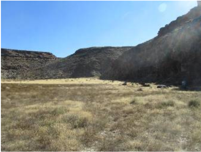
The White River Narrows

The White River Narrows site consists of seven separate petroglyph sites over about a five mile area. It lies on a dry river bed in a canyon formed by lava and sandstone. All sites are “drive up sites” serviced by good dirt roads. The glyphs at each site are very different in both style and subject matter. Some sites are found in lava rock while others are found in very soft sandstone.