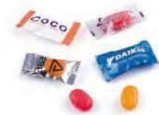
Flow pack candy