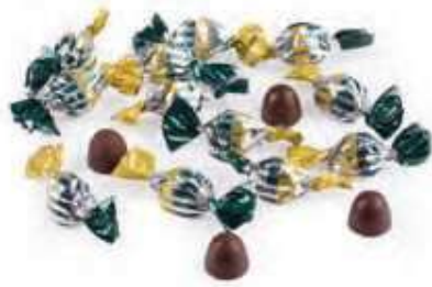
Double twist mini chocolate