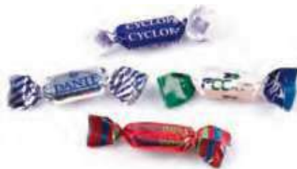
Double twist mini rectangular candy