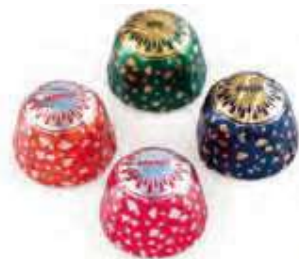
Chocolate with a liquor filling