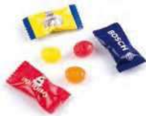
Flow pack mini candy