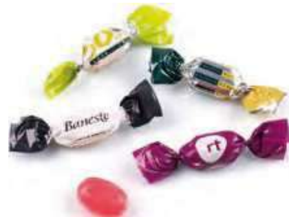
Double twist candy