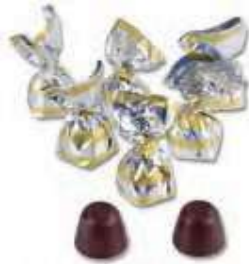
Single twist chocolate