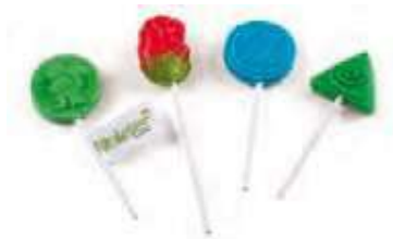
2D & 3D flat lollipops or shape lollipops