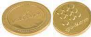
Milk chocolate coins