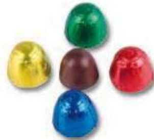
Assorted mini chocolate