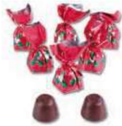
Single twist Christmas chocolate