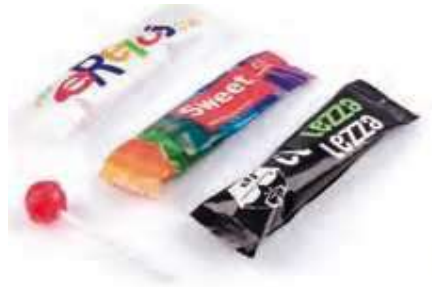
Flow pack ball or big ball lollipop

Also available with chewing gum filling, and with a sticker or tattoo inside 50 pcs./bag