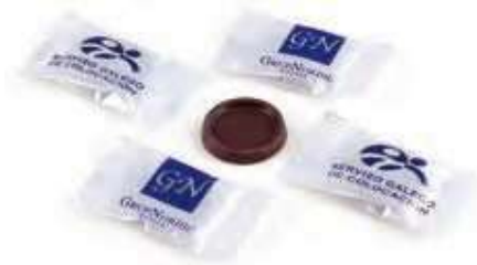
Flow pack Neapolitan