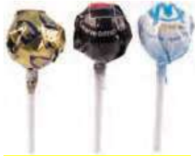
Big ball lollipop 100 pcs./bag