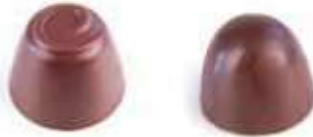
Single twist chocolate