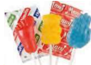
Foot, bear, hand 100 pcs./box

Also available with chewing gum filling, and with a sticker or tattoo inside 50 pcs./bag