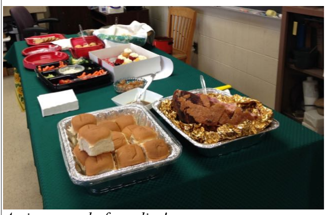
A nice spread of goodies!