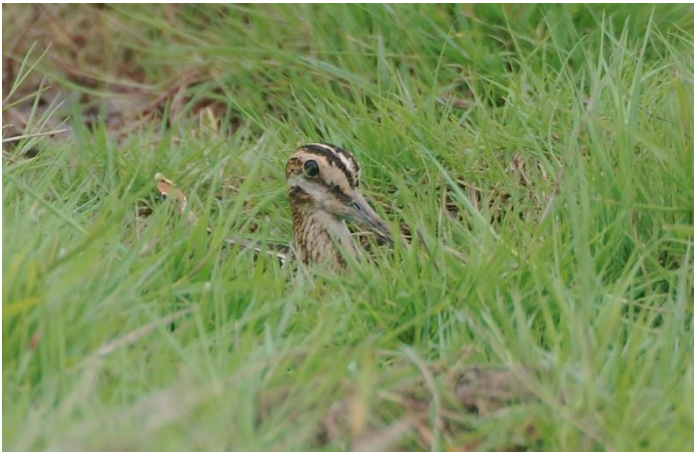
Snipe at Beachborough Lakes