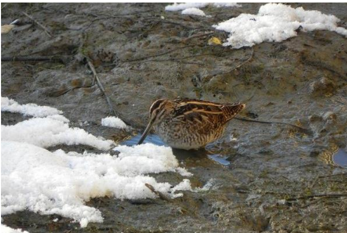
Snipe at Botolph's Bridge (Nick Hollands)

Since the 1990s it has been recorded as a common winter visitor and passage migrant.