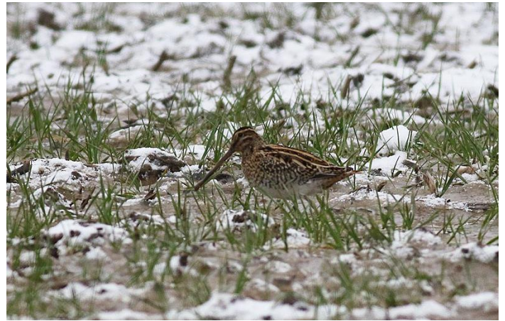
Snipe at Donkey Street (Brian Harper)