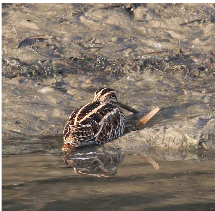
Snipe at Botolph's Bridge

The first sighting is usually in August, or even September, and double-figure counts are unusual in autumn (excluding the counts from the 1950s detailed above): ten were at Nickolls Quarry on the 17 th October 1999, 11 were at Botolph's Bridge on the 10 th October 2015, 14 were at Nickolls Quarry on the 22 nd October 2000, 17 were seen there on the 25 th September 1994 and 37 were at Botolph's Bridge on the 3 rd October 2015. Away from the marsh small numbers may be noted on autumn passage, with counts rarely exceeding five but six were at Abbotscliffe on the 29 th October 2009 and seven were seen there on the 5 th September 1991.