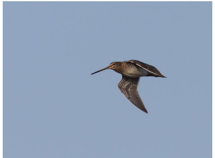
Snipe at Botolph's Bridge (Brian Harper)