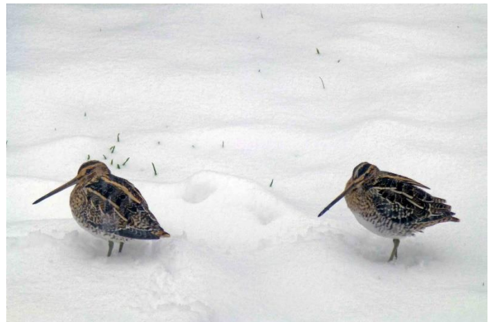
Snipe at Cheriton (Phil Lightman)