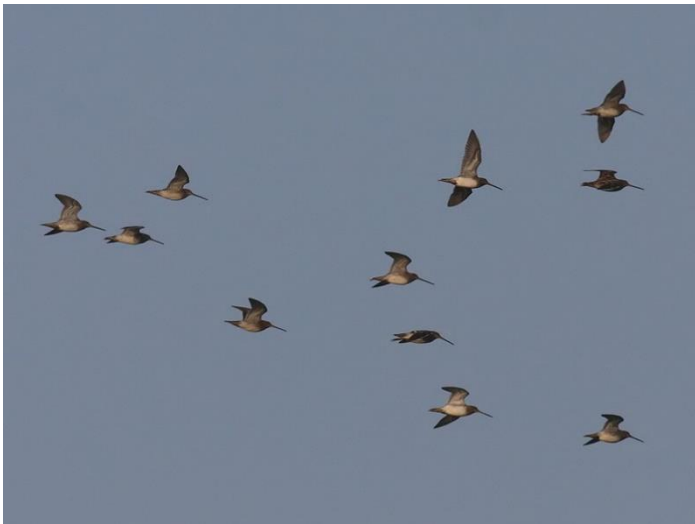
Snipe at Botolph's Bridge