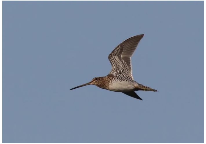
Snipe at Botolph's Bridge (Brian Harper)

Breeds in middle and higher latitudes across Europe, eastwards across northern Asia. Largely migratory, but partially migratory to resident in western maritime countries of Europe. Main winter range extends from Britain and the Low Countries to Iberia and Maghreb, thence eastwards through the Mediterranean Basin, Middle East and southern Asia. Also winters in Africa south of the Sahara.