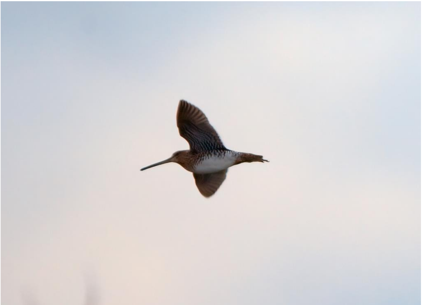
Snipe at Holy Well (Elliott Ranford)