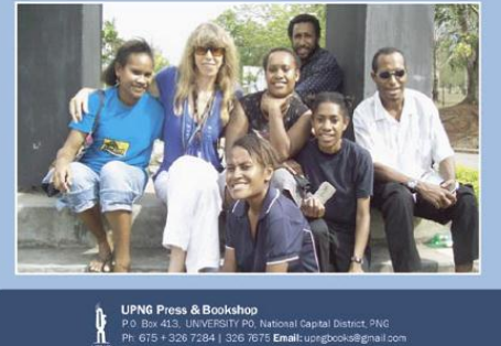
Front and back covers of Tok Ples in Texting & Social Networking: PNG 2010