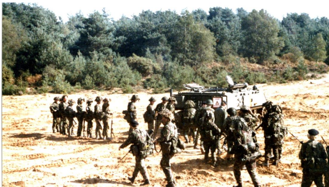
Annual Camp 1989 deploying in Armoured Personnel Carriers

The Brigade-wide communications exercise “Ex Red Shoes”, held every second year, added impetus to the communications training and in the intervening years emphasis was placed on military skills and adventure training. Ex Red Shoes was sometimes subsumed into nationwide Home defence exercises which would involve establishing AFHQs, SRHQs and county-based brigade-level HQs or Tactical Areas of Responsibility (TAORs) and the deployment of extensive ground forces.