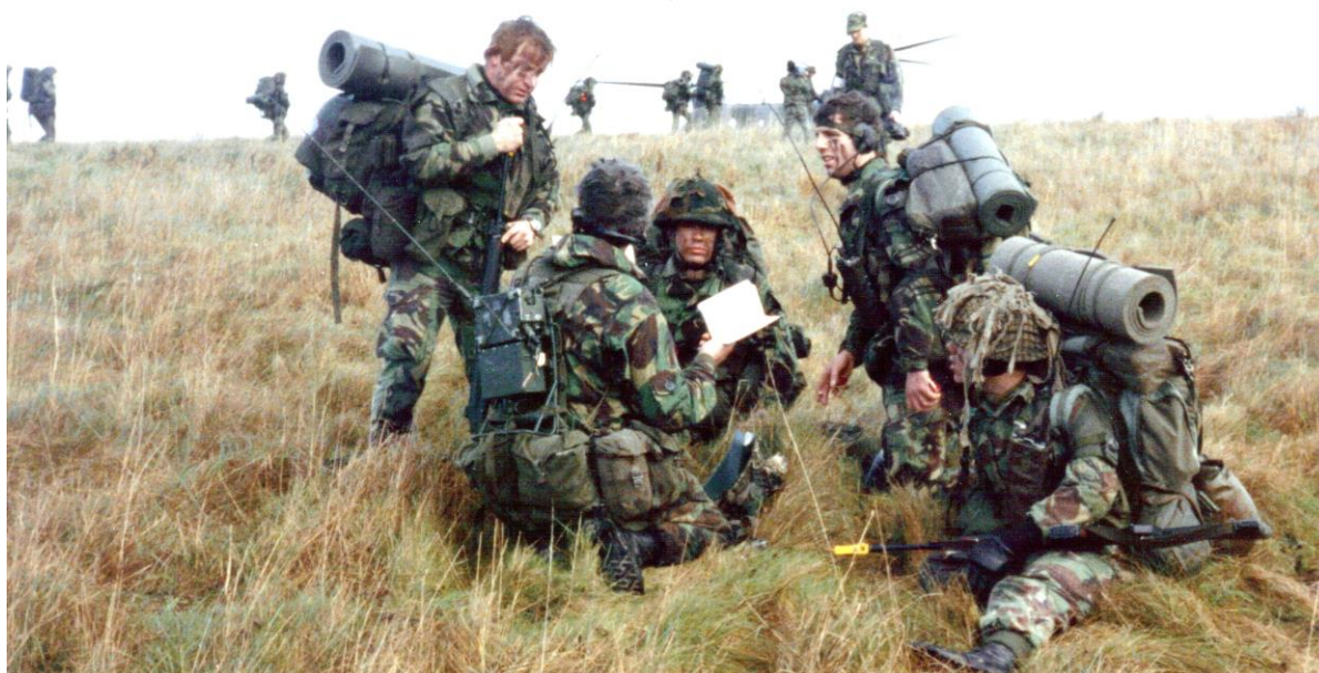
Ex Cold Start in 1989 with a Chinook in the background

Military training was also undertaken frequently. This involved deployment drills, camouflage drills, weapon training, minor tactics and Nuclear, Biological and Chemical (NBC) drills.