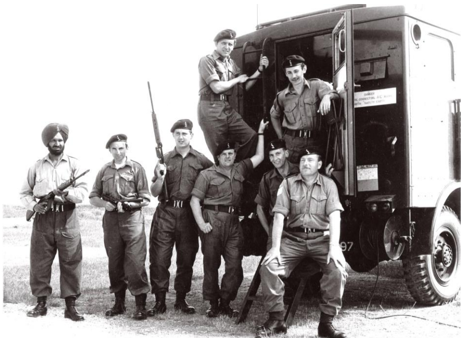
885 Troop in 1970 armed with SLRs and SMGs

From the outset soldiers were issued with either the standard 7.62mm Self Loading Rifle (SLR) or the Sterling 9mm sub-machine gun (SMG) depending on their Royal Signals trade. Officers were issued with the 9mm Browning L9A1 pistol. In addition each troop was equipped with the standard light machine gun (LMG). The development of these weapons dated back to the Second World War.