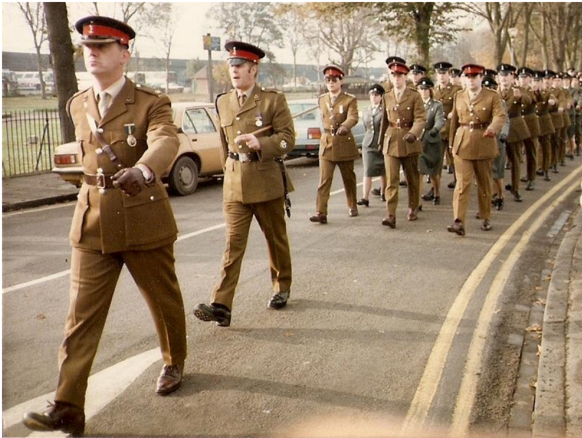
Remembrance Parade Windsor in 1984 in No 2 Dress

From 1969 onwards the Squadron continued to hold Remembrance Sunday parades in the centre of Windsor where the Regimental memorial to members of A (Windsor) Squadron, Berkshire Yeomanry, was erected in 1925. The site of this memorial had originally been close to the TA Centre (at that time in Windsor High Street and from 1949 in Clewer Mead) but in 1963 a new TA Centre was opened in Bolton Road, some two miles away, and thereafter it became necessary to transport the troops to the Town Centre for the Parade.