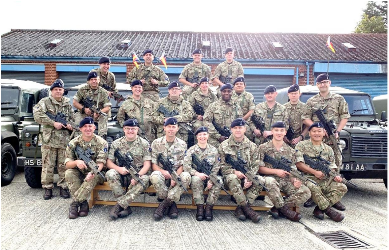
Main Party at Windsor prior to deployment

At the time of publication, the Squadron has recently returned from deploying with all Squadron Communications Assets on Ex JAVELIN ASSURE 6 th -21 st September 2019. This is a Brigade level Communications Exercise which included a Change of Command with 32 Signal Regiment in order to maintain the Corps WAN. More on that in the next Journal.