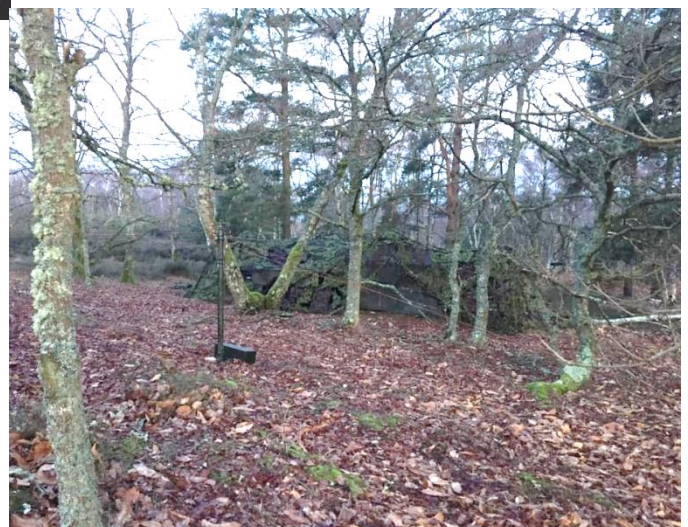
Back to basics Det Cam and concealment

On a cold, wet and windy weekend in January, the Squadron started getting "Back to - comms - Basics" in the Aldershot Training Area. Exercising on the new VHF upgraded platform, refreshing our concealment, voice procedure and military skills. With our focus over recent years being on UK ops, we had nearly forgotten how much fun could be had putting up Cam in webbing!