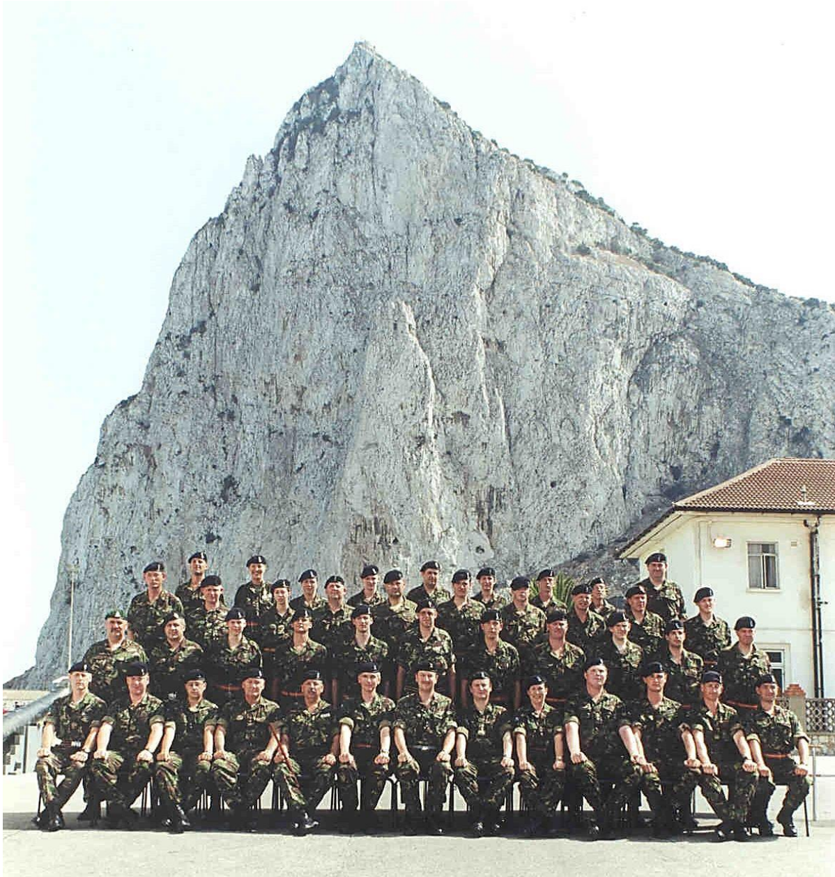
Gibraltar in 2003

In 2003, despite the absence of those mobilised on Operations, training continued and for June's Annual Camp forty-three Squadron personnel were transported by Hercules C130 aircraft to Gibraltar. Ex Marble Tor, supported by the Gibraltar Regiment, was a busy two weeks involving military training, such as OBUA (Operations in Built Up Areas) and FIT (Fighting in Tunnels). Activities included The Rock Run (running more than 4 kilometres to the top of the Rock), adventurous training and amphibious training.