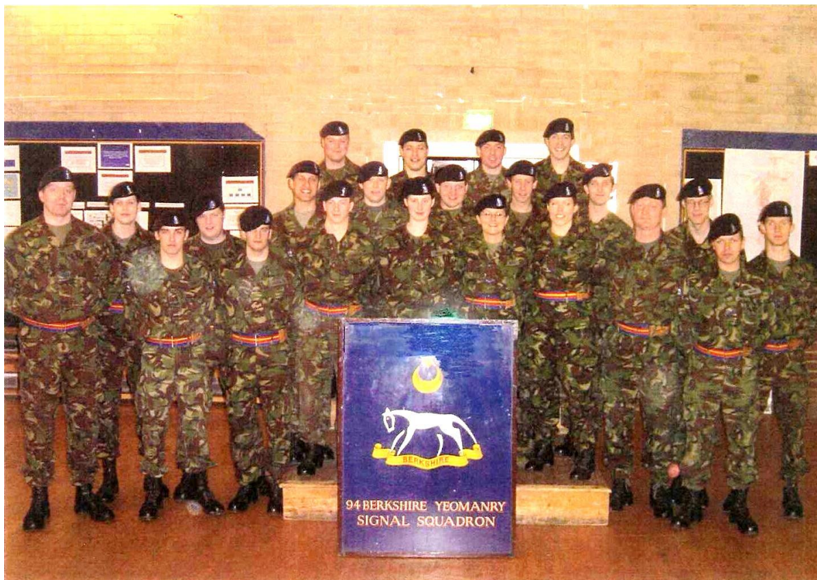
Berkshire Yeomen selected for mobilisation in 2003

In 2003, faced by the perceived threat of Weapons of Mass Destruction and the added uncertainty in the war against terrorism, the USA and its allies decided to invade Iraq. Deployment commenced in January 2003 with combined forces of 195,000 from the United States, United Kingdom, and other countries.