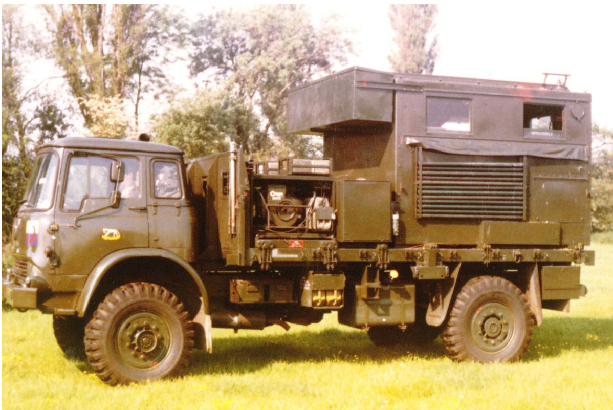
Bedford MK box body fitted with D11/R234 and generator

The Cold War was at its height and Squadron's primary role was to provide communications for Military Home Defence particularly in the event of Nuclear War. For Home Defence, the UK was divided into ten regions and No 6 Region had its Armed Forces Headquarters, known as 6 AFHQ, based in Aldershot. The Squadron's role was to provide 6 AFHQ with post-nuclear-strike communications and, to do so, it was equipped with (i) high power long-range High Frequency (HF) radios providing Control-by-Radio (CONRAD) communications from 6 AFHQ to various Government agencies and other AFHQs, via relay stations known as Gateways, and direct to its two sub-regional HQs (SRHQs), and (ii) shorter range HF Larkspur radios for communications within the sub-regions. At that time, given the comparable resilience to electro-magnetic interference, HF systems were regarded as more survivable than Very High Frequency (VHF) and Ultra High Frequency (UHF) systems in the circumstances of Nuclear War.