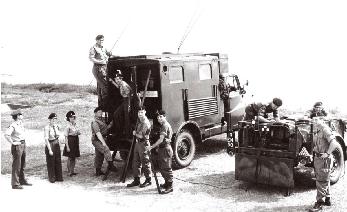
AFHQ Signal Troop at Scarborough Camp in 1970 deploying the generator-powered Larkspur D11 HF Radio mounted in an Austin K9 1-ton radio vehicle

In 1969 the Government of the day sought to reverse some of the more severe effects of its 1967 reorganisation of the TA and further changes saw the Berkshire Yeomanry re-roled from Infantry to Royal Signals. 94 (Berkshire Yeomanry) Signal Squadron was formed, sourced from the Royal Berkshire Territorial soldiers at Reading, Newbury and Windsor together with elements of Royal Signals units based at Southampton and Reading (including elements of 63 Signal Regiment which had been disbanded). The Squadron's troops were located at TA Centres in Reading, Southampton and Windsor.