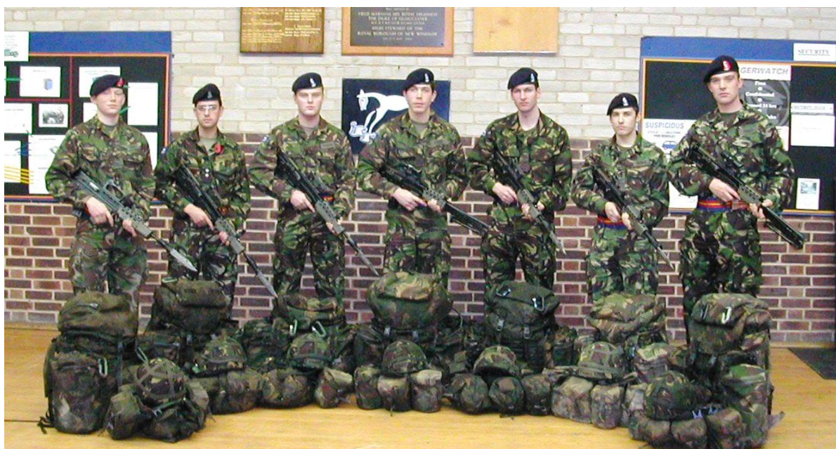
The Lanyard Trophy Team in 1990

71 (Yeomanry) Signal Regiment established a regimental shooting team in the 1970's. A pavilion in the grounds of the National Rifle Association at Bisley, nicknamed the Bisley Hut, became the shooting team's home. It was a substantial timber building and could sleep some 70 all ranks. The shooting team, administered by the Squadron, regularly trained at Bisley and the Squadron often provided more than half the team members. The team was often successful and won many awards at TA and Corps Skill-at-Arms Meetings. More recently, the Squadron has continued to provide individuals within the current Regimental Shooting team.