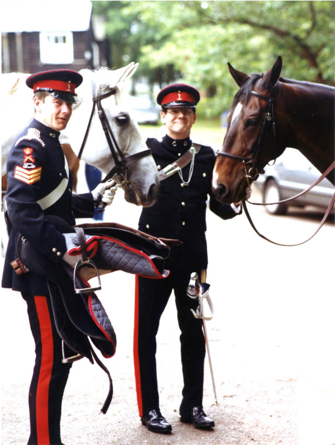
Sqn members demonstrating their equitation skills in 1986