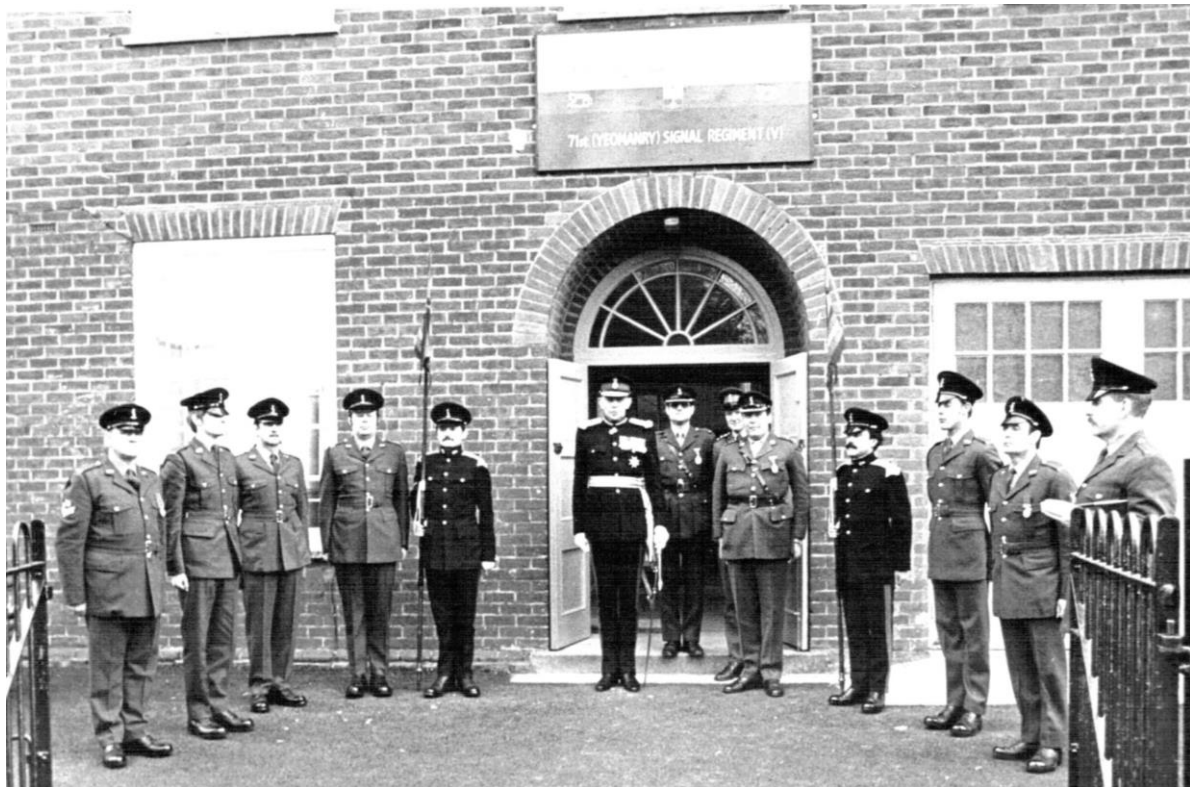
The opening of Chertsey TA Centre in 1977

In 1977 a past Berkshire Yeomanry association with Chertsey was rekindled with the re-opening of the TA Centre there and in 1978 this became the home for 886 Signal Troop. In addition, in order to meet an additional role within CONRAD for long range communications, a new troop was established at Windsor, designated C2 Troop. This additional role was phased out in 1987.