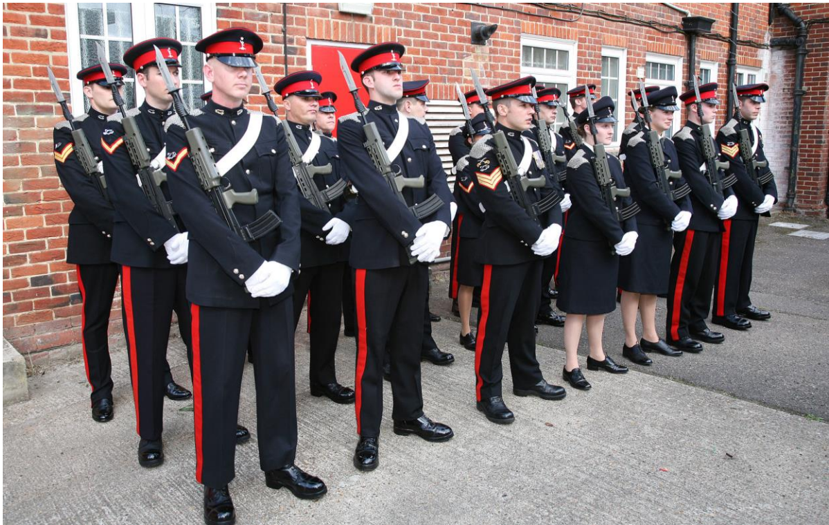
886 Troop in No 1 Dress with the SA80

In 2012 Future Army Dress (FAD) was introduced updating and replacing No 2 Dress but the issue to Reservists was again limited to SNCOs and those soldiers needing it for courses or ceremonial uses.