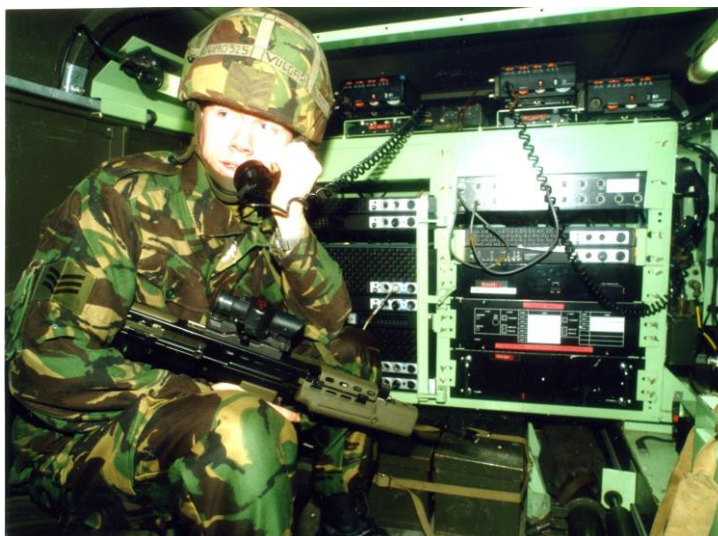
Landrover-borne MOULD station

By the mid 1980's it had become clear that the D11/R234 radio was reaching the end of its useful life, and the design and testing of a new system began. All D11/R234 equipment was back-loaded in 1987 and there followed a few lean years awaiting delivery of the new system. During this time the mainstay of the Squadron's communication training was the Clansman range of HF 320 (manpack) and 321 (vehicle-borne) radios, which had replaced the ageing Larkspur sets in 1984.