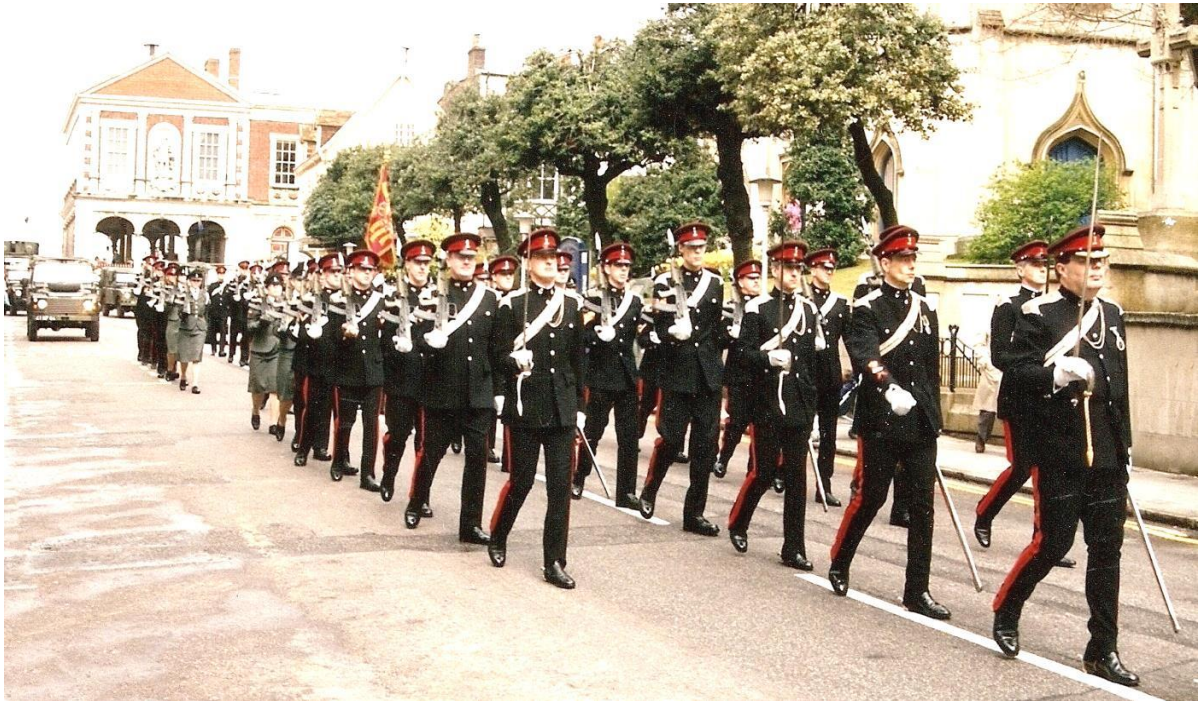
Windsor Freedom Parade in 1994