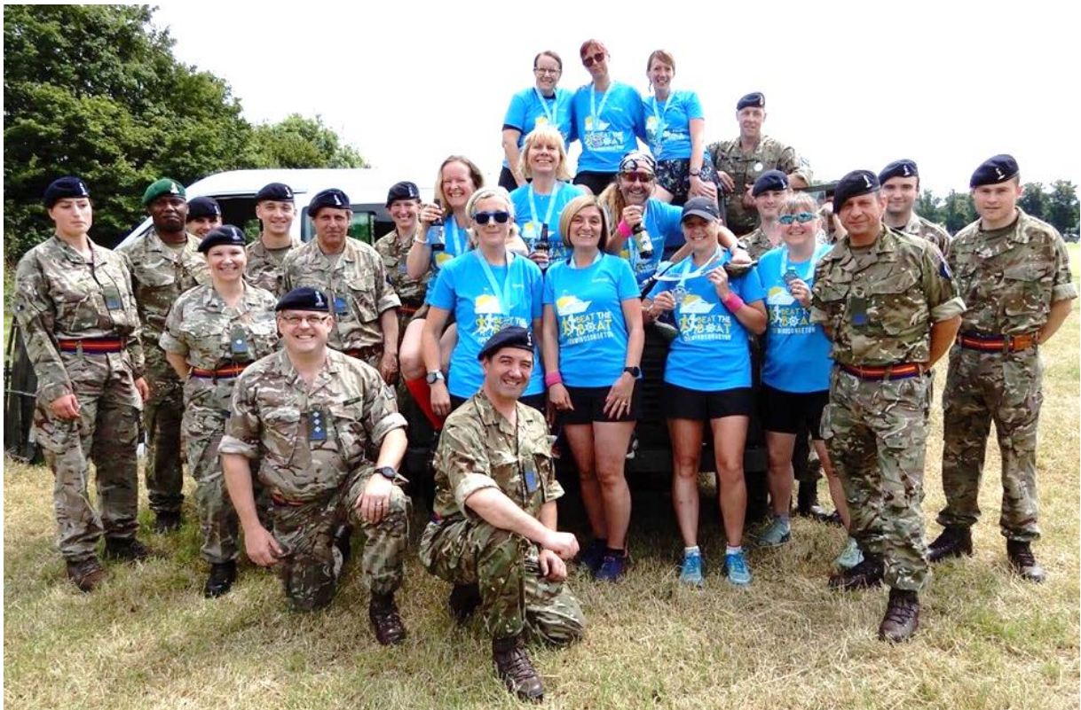
The Squadron supporting Beat the Boat event in Windsor