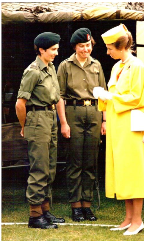
HRH Princess Anne with Sqn members