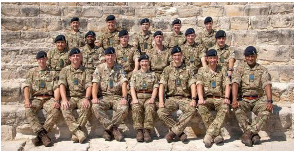
Annual Camp in Cyprus in 2018