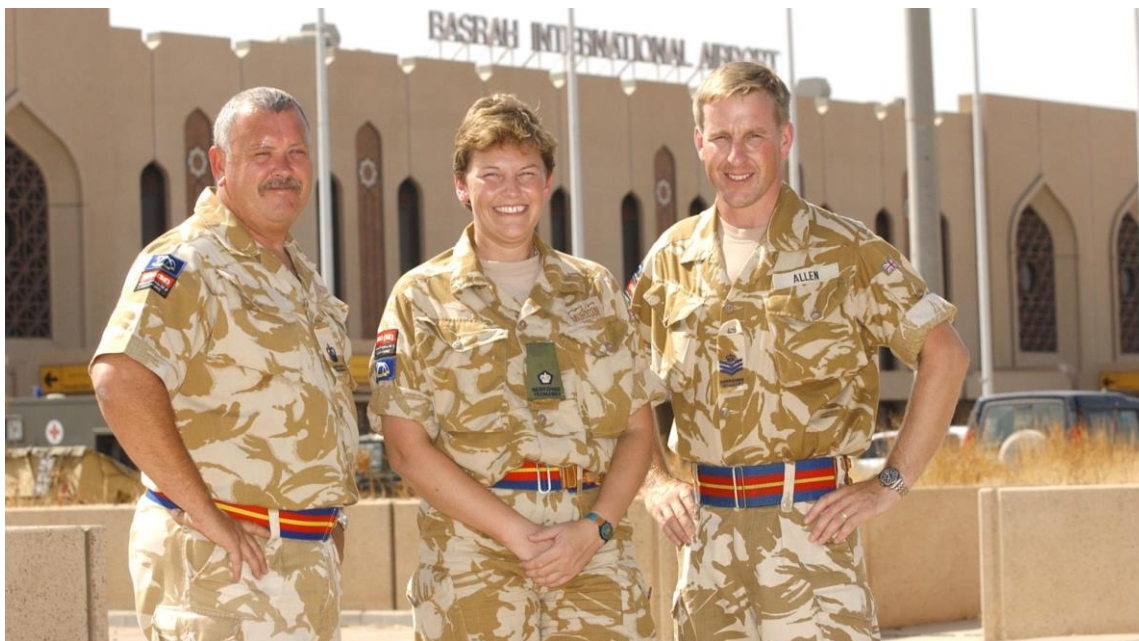
Op Telic 2: in Basra in September 2003

The deployment of UK forces, called Operation Telic, included 6,000 reservists mostly from the TA and was the first such mobilization of the TA since the Second World War. At one stage reservists constituted 28% of UK forces in theatre. Twenty-one soldiers from the Squadron were mobilised and deployed on the first phase and simultaneously four more were deployed on Operation Oculus in Kosovo. A further four were deployed later in 2003 on Operation Telic 2, the start of many similar deployments in subsequent years.