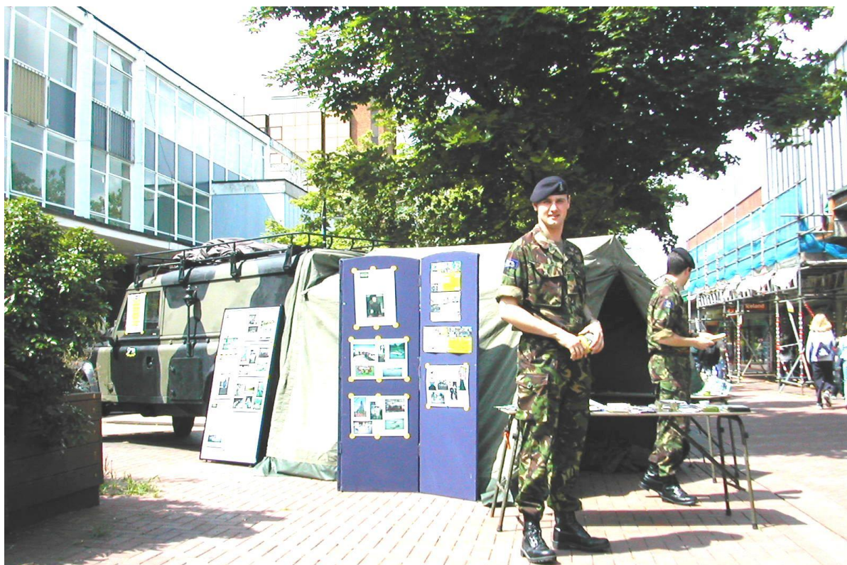
A recruiting stand in Reading town centre

During its early years the Squadron had an establishment of 12 officers and 140 soldiers and, with three TA Centres, was often fully recruited. However it was clear that recruiting was a non-stop process and considerable effort was expended in local advertising, attending local events, and leaflet drops. Today the current establishment is 5 officers and 109 soldiers, a considerable reduction particularly in officer strength. Between 2010 and 2012 the Army reduced the resources available for recruiting for the Reserve and this led to significant falls in the strength of many Reserve regiments. Fortunately this trend has been reversed and focused efforts at Squadron and Regimental level are beginning to show improvements in recruiting and retention.