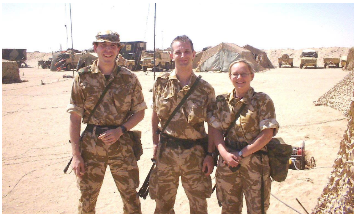
On Operations in Kuwait in 2003

In 2003, faced by the perceived threat of Weapons of Mass Destruction and the added uncertainty in the war against terrorism, the USA and its allies decided to invade Iraq. Deployment commenced in January 2003 with combined forces of 195,000 from the United States, United Kingdom, and other countries.