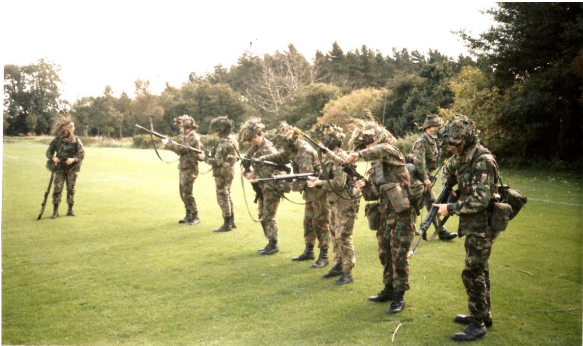
Annual Camp 1987: Preparing for FIBUA drills

For many years Annual Camp, a two-week period of continuous training, provided the main focus for the training programme each year. This was usually well-attended by all ranks with up to 90% of the Squadron deployed for 2 weeks.