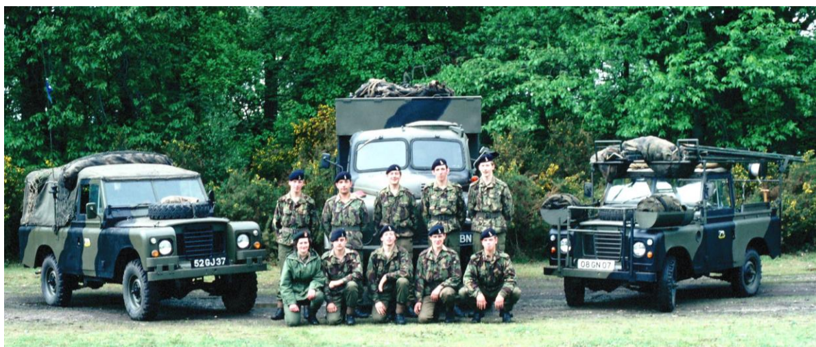
The radio and line detachments of SHQ Troop at Annual Camp in 1982