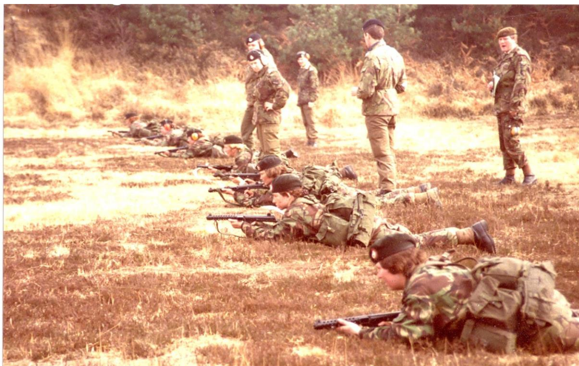
WRAC members of the Squadron on Pirbright Ranges c 1980

On formation in 1969 the Squadron's role entitled it to recruit and enlist female officers and soldiers. At that time all women attached to Royal Signals units served in the Women's Royal Army Corps (WRAC) and were uniformed and badged accordingly. They were not permitted to carry weapons and quite often their personal equipment was inferior in quality compared to their male counterparts. It was some years before this situation was rectified. The WRAC were fully integrated into Royal Signals in 1982.