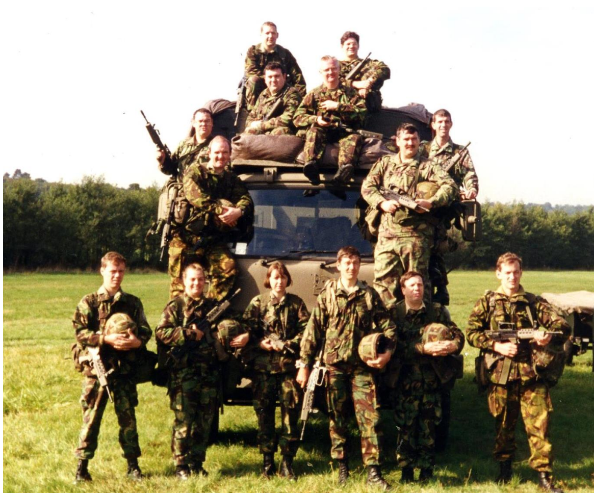
Squadron Headquarters in 1995: in its independent role SHQ needed to be much larger