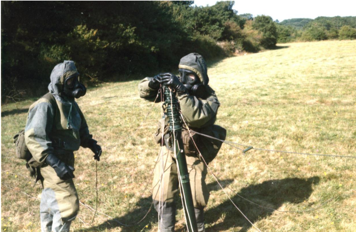
Comms drills in full NBC kit

Royal Signals recruit training had also become centralised and consisted of a number of preparatory weekends followed by a two-week course run by the Regular Army. From 1976 these courses were run at Catterick and in 2000 these were moved to Blandford. Since 2015 recruit courses for Reservists have been centralised across All Arms and take place at four designated Army depots.