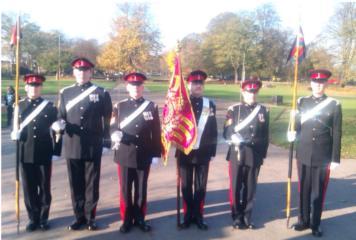
Guidon Party and Lance Guard November 2011