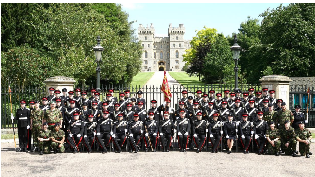
Freedom Parade Windsor 2008 to mark the 100 th anniversary of the formation of the TA