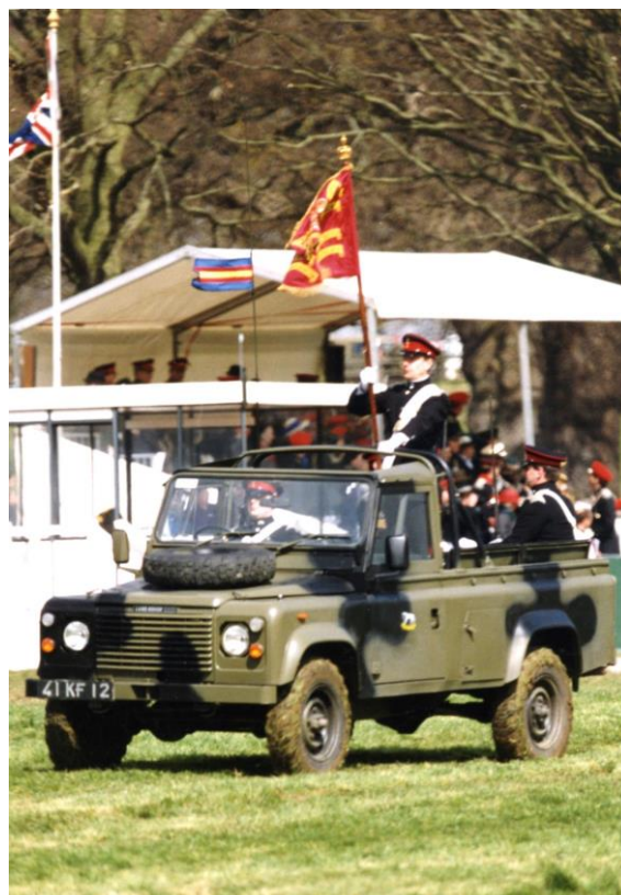
Royal Review - Windsor Great Park 1994

On 25 July 2009 the Squadron was honoured by the granting of the Freedom of Entry to the Borough of Runnymede in recognition of the close links between the Squadron and the town of Chertsey. The event was marked by a parade through the towns of Chertsey and Addlestone.