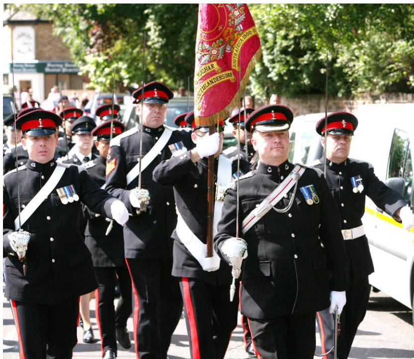
Runnymede Freedom Parade 2009

In the 1980’s the Army decided to seek to establish closer links between the Regular Army and the Territorial Army and the “One Army” concept came into existence with much improved equipment levels for the TA as a whole and greater cooperation in training.