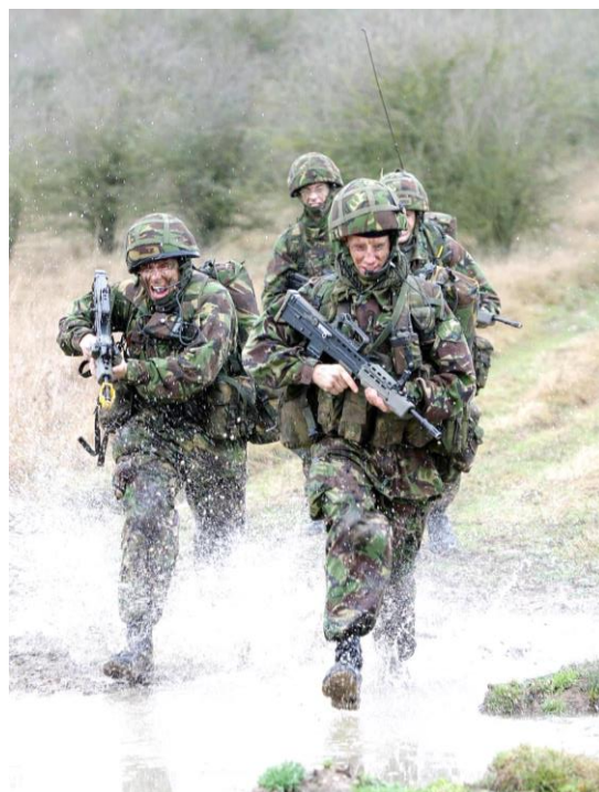
A patrol in Combat 95

Prior to the introduction of MTP the standard daytime working dress in the Army was known as barrack dress, distinguished by the use of the green heavy wool pullover in winter and shirt-sleeve order in summer. Squadron officers had the further distinction of wearing a blue pullover.