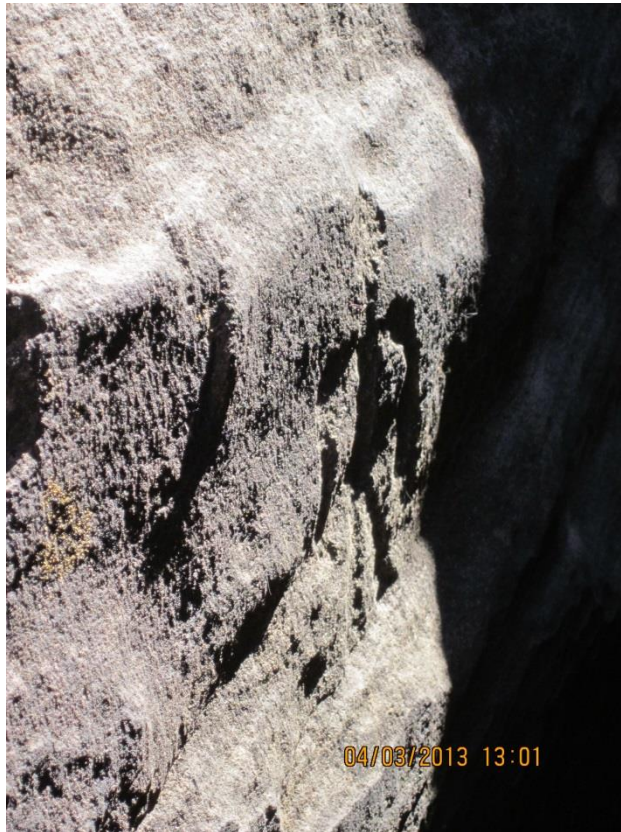
Close up of deeply etched figure