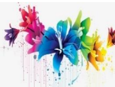
Flower Festival 13-15 August

ST. WULFRAN'S FLOWER FESTIVAL Our Lady of Lourdes Church has participated in this Flower Festival by decorating the Lych Gate and St. Patrick's Church has made an arrangement on the theme of Trinity Sunday, to show how St. Patrick explained the Trinity to his followers, using the shamrock as a symbol. The church is looking beautiful with all these lovely displays so do come to visit if you can.