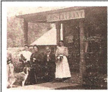
1908 Postcard of Cora's Restaurant

A perfect summer day set the scene for the 2011 Wanakena 4th of July parade and duck race. Many summer and year-round residents had a house-full of guests to either watch or participate in this year's events.