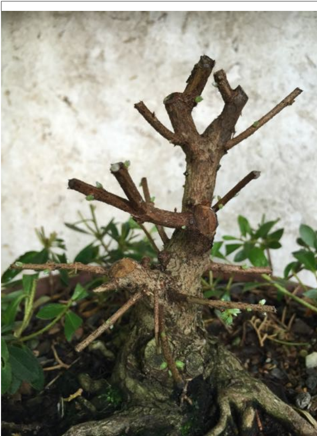
Trimmed on May 14, photo taken May 31. Budding nicely!

most of the cuttings also seem to be doing well.