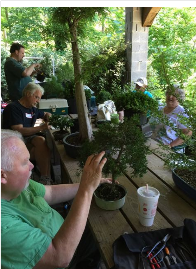
It was a beautiful day for working outside!