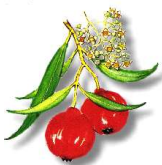
'Quandong' painted by Rosemary Pedler