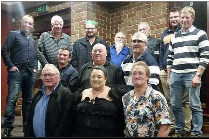
October 30th was Mills' Freightlines Christmas celebration and awards night

Next Black & White Rag deadline Midnight December 31 Editor: 8846 2260 0427968846 aragreen@bigpond.com