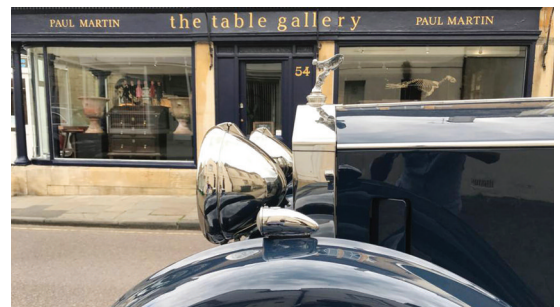
The Table Gallery Exterior