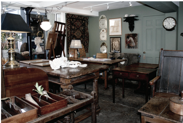
Interior of The Table Gallery

garden. Made by an artisan from just up the road, it's humble, practical with no pretence."