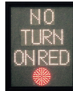
24 x 30 Clear Lens Single Row