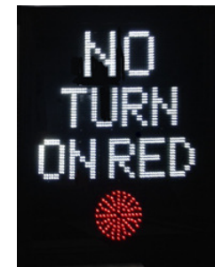
24 x 30 Black Lens Dual Row