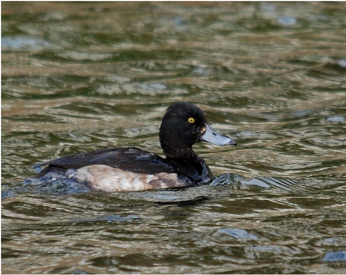
Tufted Duck at Samphire Hoe