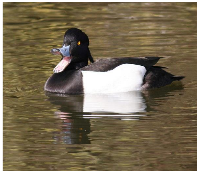
Tufted Duck at Seabrook (Brian Harper)

In Kent it is a regular breeding species on suitable waters, also a passage migrant and winter visitor.