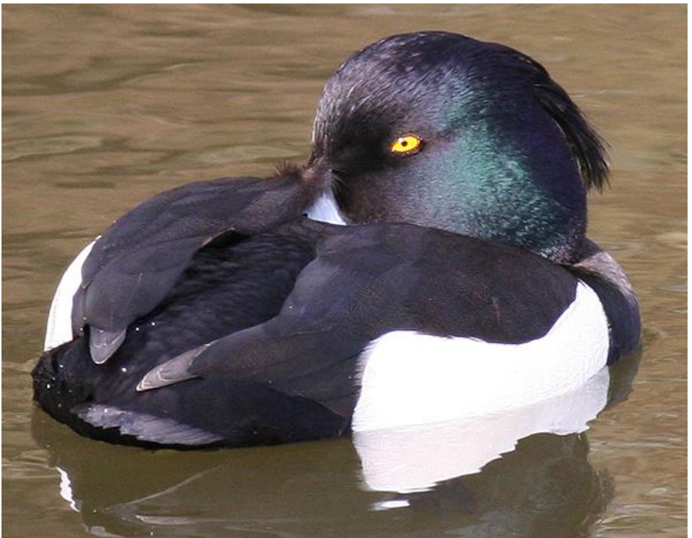
Tufted Duck on the Royal Military Canal at Seabrook