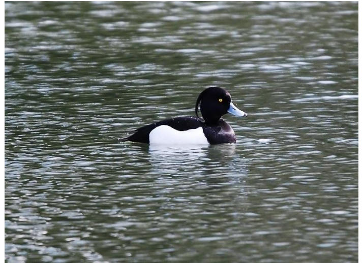
Tufted Duck at Beachborough Lakes (Steve Tomlinson)

Nickolls Quarry has become increasingly less attractive to wildfowl in recent years due to increased disturbance associated with the formation of a new leisure club at the site and commencement of habitat degradation through development works. The last double figure count at the site was 13 on the 18 th January 2017.