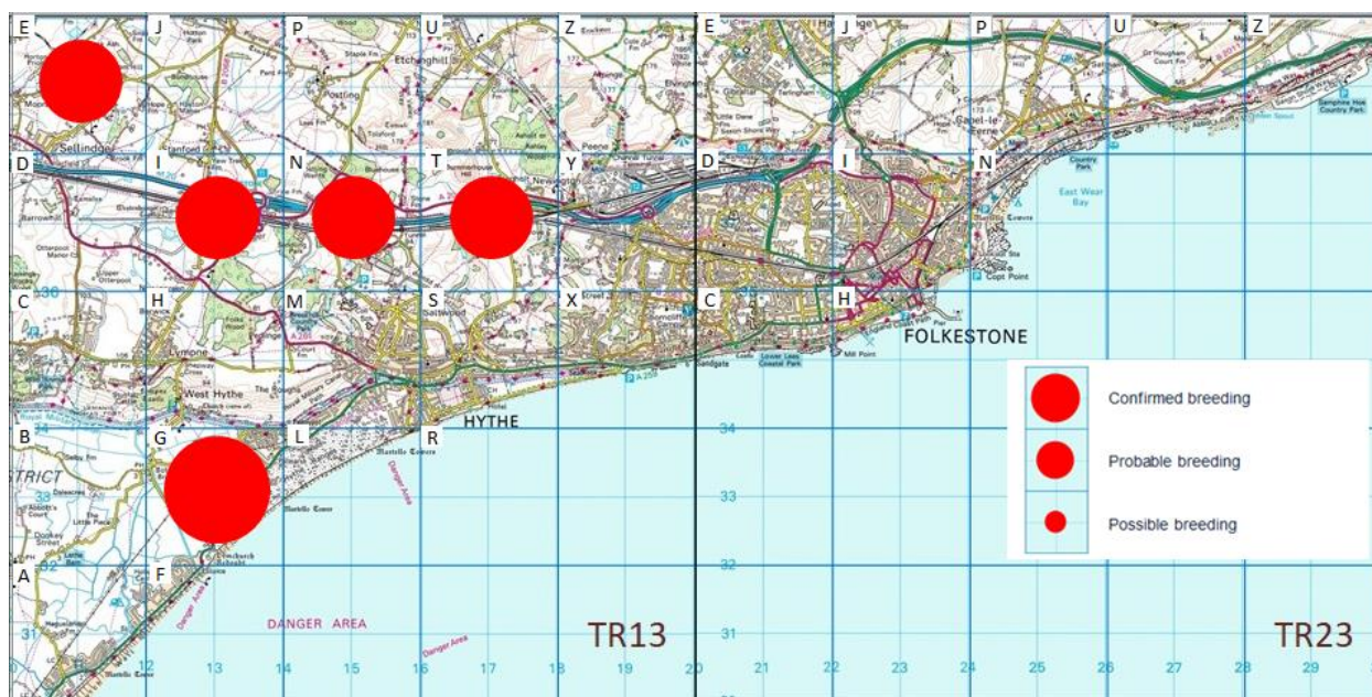
Figure 1: Breeding distribution of Tufted Duck at Folkestone and Hythe by tetrad (2007-13 BTO/KOS Atlas)

Figure 1 shows the breeding distribution by tetrad based on the results of the 2007-13 BTO/KOS atlas fieldwork.