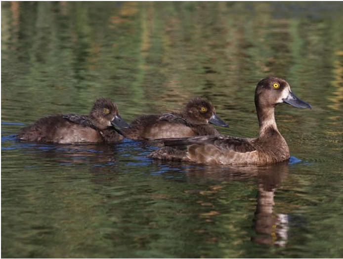
Tufted Duck at Botolph's Bridge (Brian Harper)

The large counts from the 1980s have never been repeated and counts of 40 or more have been noteworthy since, usually associated with cold weather. Up to 46 were present at Nickolls Quarry in February 1991, with 40 there in January 1993, up to 48 there in February 1996, 43 there in January 2003 and up to 53 there in December 2010.