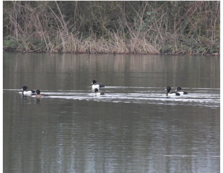
Tufted Ducks at Folkestone Racecourse