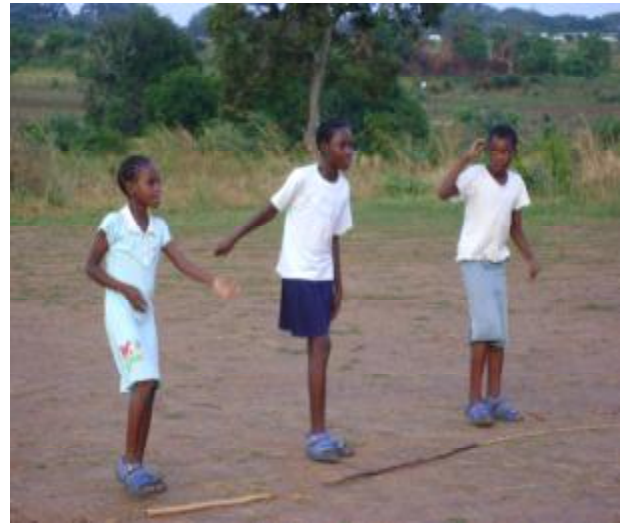
Kid playing before and after School

At around 09:00hrs, the mid-morning group to go to school. They wear their uniforms, comb their hair take up their school bags and head for school.