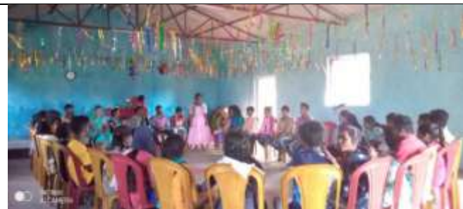
Orientation meeting to the GP level federation members on consequences of child marriage and child labour