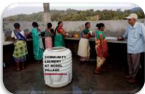
Community laundry brings joy to all especially to the women of Dimbiripankal model village