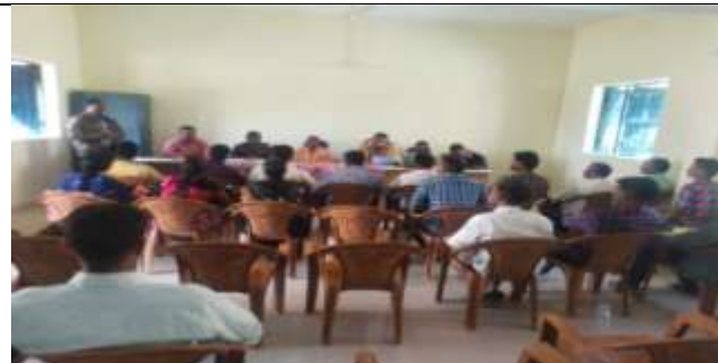
Project staff attending panchayat level MIS meeting