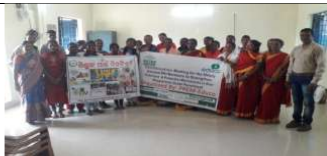
GP level task force sensitisation meeting in Daringbadi block