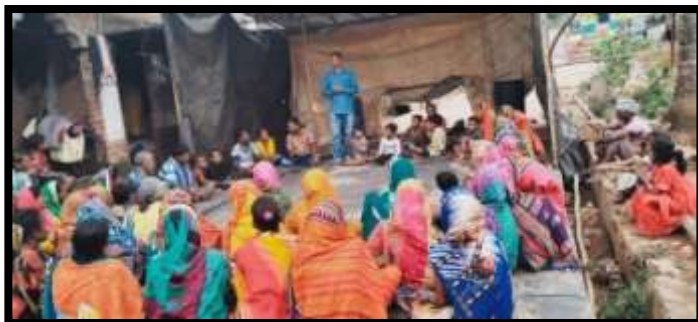
Community level meeting and identification of vulnerable families

A series of Community meetings have been organized in 200 villages of Mohana and R.Udayagiri