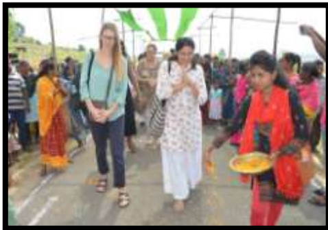
Welcome to the steering committee members

A high-level delegation visited Jeerango Gram Panchayat on 1st November 2022. The delegation constituted the Steering Committee of the UNFPA-UNICEF Global Programme to End Child Marriage (GPECM) and is a 15 years global initiative that seeks to tackle child marriage in 12 countries where child marriage is very prevalent. The delegation