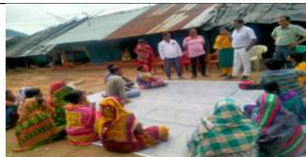
Visited BDO, PD, DRDA of Gajapati to Kamalapur village of Jeerang GP Mohana