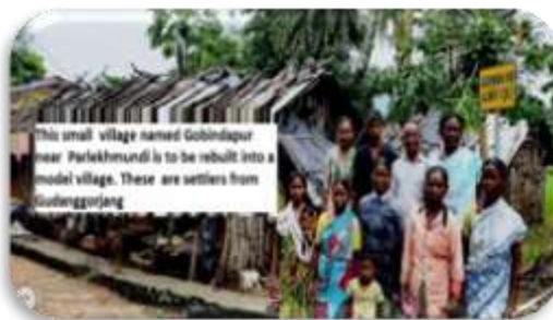
For the first time Groundnut is cultivated in Gudanggorjang model village