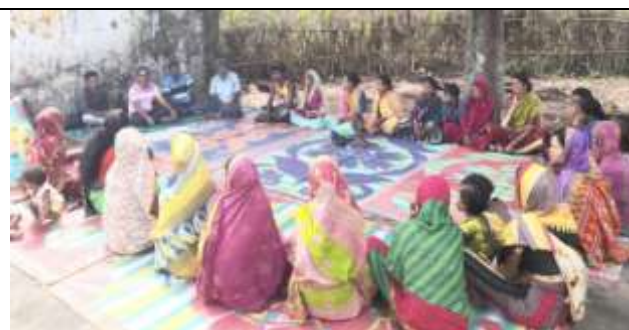
Village meeting at project operational areas