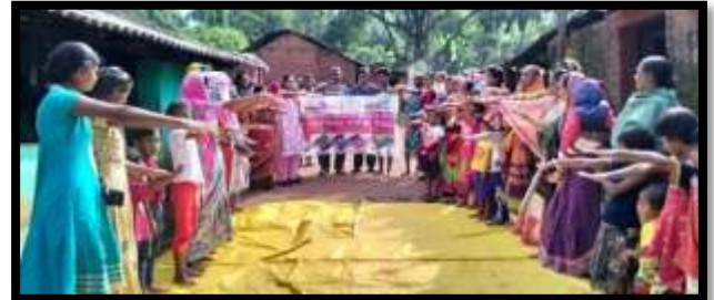
Oath taking by the participants on the eve of International girl child day to ensure child care and protection in their village

youths, community leaders, VCPC members, teachers, PRI members, ICDS workers, Supervisors and teachers.