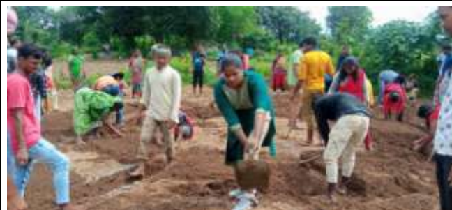
Hands on Practice on Nutrigarden