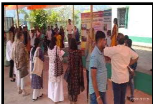
Visit of the Steering Committee members to the field

Then the team members shared guests about the objectives and leanings of election awareness campaign among women prior to the panchayat election which was held in Gajapati district of Odisha in January-February 2022. The guests visited the women's and girl's desk office to understand its function and interacted with the standing committee members of women and child development in the panchayat. In the Panchayat conference hall, villagers shared the different methods initiated by them