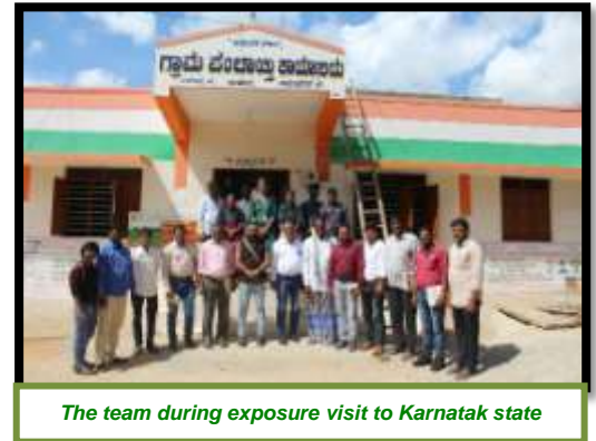
The team during exposure visit to Karnatak state

Educo in India has facilitated an exposure visit for a team from PREM (local partner NGO), comprising of elected representatives of Gram Ganchayat, Government officials from the State Institute of Rural Development (SIRD), Govt of Odisha and representatives from PREM. This team visited the Child Rights Trust, Bengaluru office and the field operational areas at Shidlaghatta and Bagepalli, Chikkaballapura District from the 21st to 23rd September 2022 to know about children's