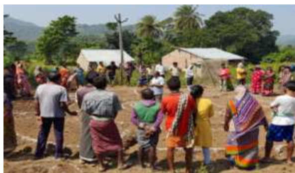
Training to the farmers on Big circle Nutrition garden.