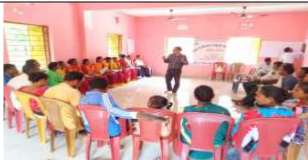
Panchayat Level Orientation Programs