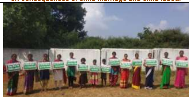
SHG meeting on ensuring care and protection of the children