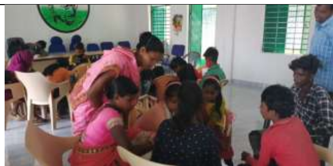
GP level federation meeting on identifying their issues