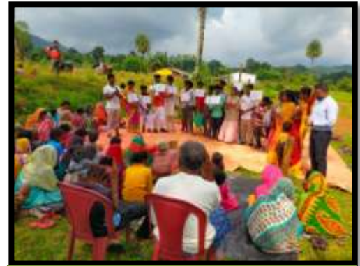
Cultural program by the adolescents on the consequences of child marriage and child labour

towards addressing all these issues. This program was very effective among parents and village people. It had a positive impact on the adolescents and as well as the community people.