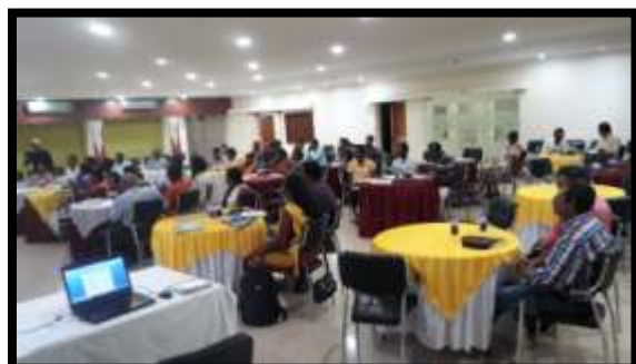
State level module development workshop on Women and j Panchayat