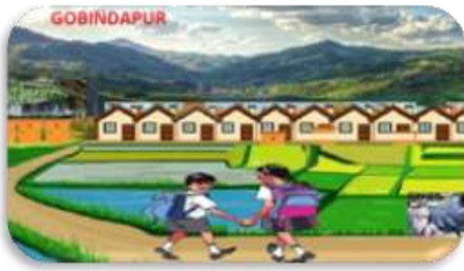
Artist's view of the new village under one roof