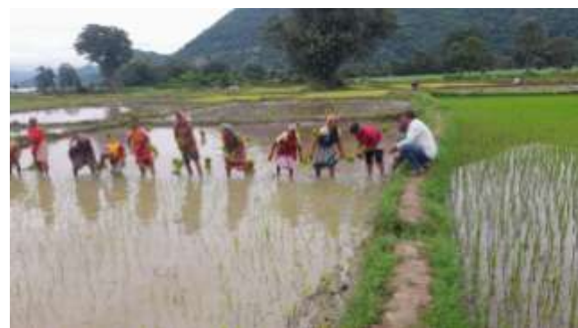
SRI method paddy plantation in operational villages of Gajapati district