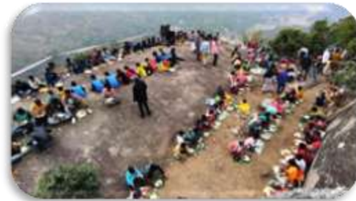
Annual Gudanggorjang village picnic on 2 nd January 2023 on Olmal hill top.