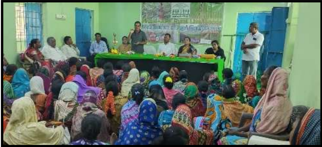
Meeting organised during Distribution of Agricultural Implement - Manual Weeder machine