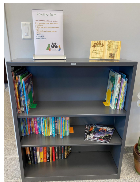
Community Humane Shelter of Steuben County

We are extremely grateful to be making progress on our libraries. Our second LfC library is now set up at the Community Humane Shelter of Steuben County. We are also very excited to announce we have been selected to receive a grant from the Steuben County Community Foundation to purchase several hundred more books for Steuben County! We will be working around the clock to get these books ready for the kids! Stay tuned, as we work to finish more libraries.