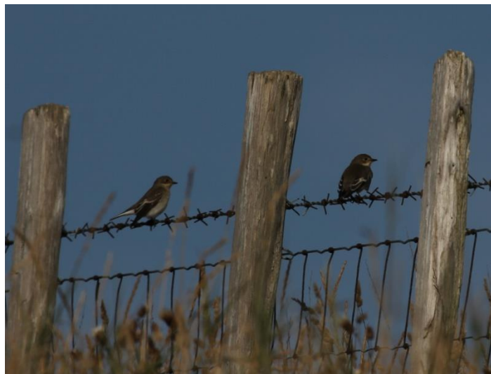
Pied Flycatchers at Abbotscliffe