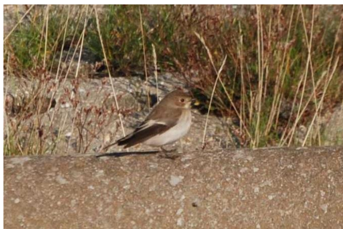
Pied Flycatcher at Samphire Hoe (John Lees) – one of the two October sightings