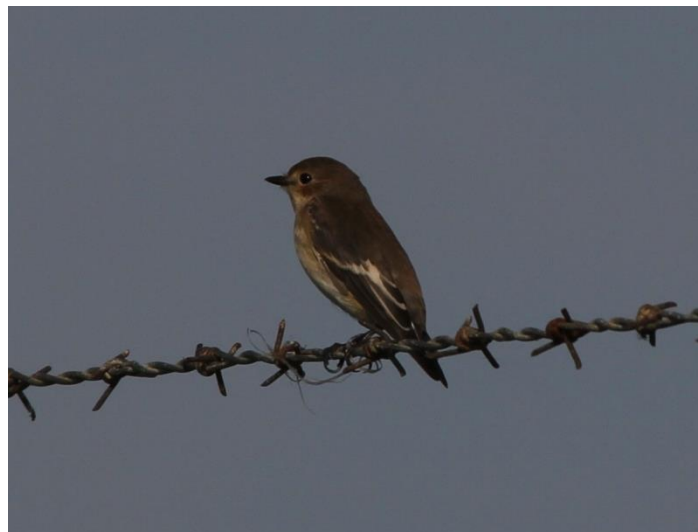
Pied Flycatcher at Abbotscliffe