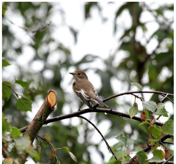
Pied Flycatcher in a garden in Folkestone (Dale Gibson)