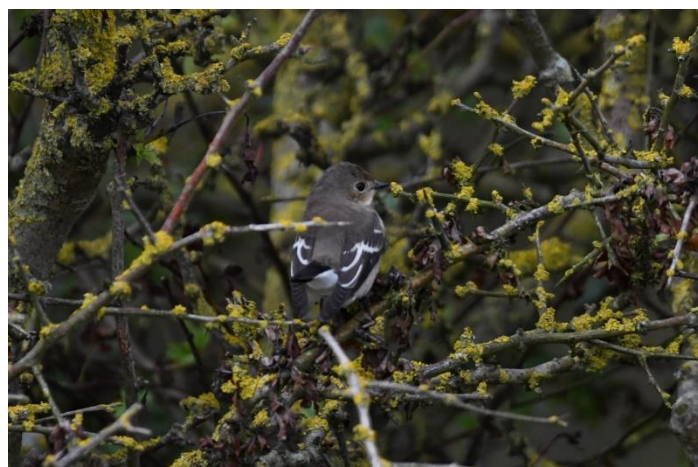
Pied Flycatcher at Abbotscliffe (Elliot Ranford)

In autumn it can occur from late July, when one was at Samphire Hoe on the 23 rd July 2007, with two there on the 24 th July 2006, but is more usually noted in August and September.