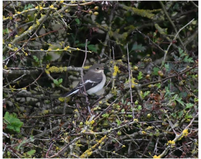
Pied Flycatcher at Abbotscliffe (Elliot Ranford)

In Kent it is a scarce spring and regular but decreasing autumn migrant.