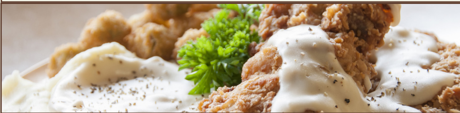
Served with a house salad, soup, or mac & cheese, your choice of two dinner sides, and a dinner roll