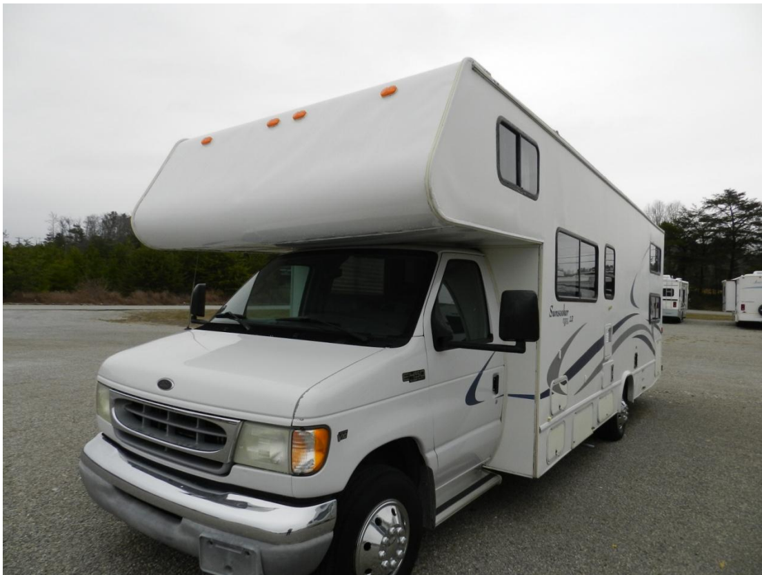
Forest River Sunseeker 2, Ford E450