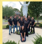
Aroma de Cristo